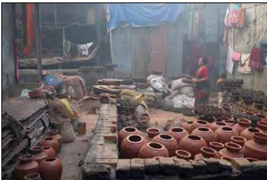
Figure 4: Pottery unit in Dharavi, Mumbai

Further pull factors include clusters of similar businesses which act as a magnet for employees, such as leather goods in Dharavi, Mumbai. Public services are easier to fund in densely populated areas. Cities therefore have better health and education outcomes which tend to increase productivity and incomes. These advantages attract more migrants. Cities fund art and culture, have an openness to science and education and display the toleration required to benefit from ethnic diversity. Creative people are attracted to cities and are associated with economic dynamism.