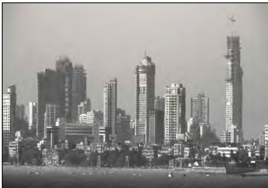
Figure 3: Mumbai skyline from Nariman point

Greater Mumbai had a population of 12,478,477 in 2011 (Government of India Census). This was 4.7% larger than in 2001, when the Census recorded a population of 11,914,398. Greater Mumbai occupies 438 km 2 yet the metropolitan area is almost ten times bigger at 4,355 km 2 . The area includes outlying townships that are million cities on their own account. It is estimated that the total population of Mumbai, including the metropolitan area is 20.5m. According to the International