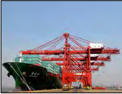
Figure 6: Jawaharlal Nehru Trust Port

Push factors from the countryside are also significant in explaining rural-urban migration. Loss or degradation of farmland and pastureland due to development, pollution, land grabs, or conflict are important push factors. Also, the growth of mass transportation and improved communication within developing countries decrease the intervening obstacles to movement.