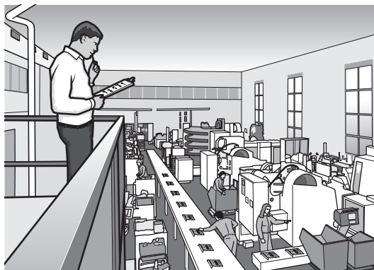
Fig. 4.1 'getting on the balcony'