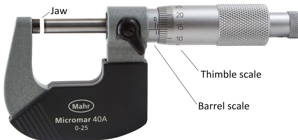
Image source: Lucasbosch, CC BY-SA 3.0 , labels are added to the image