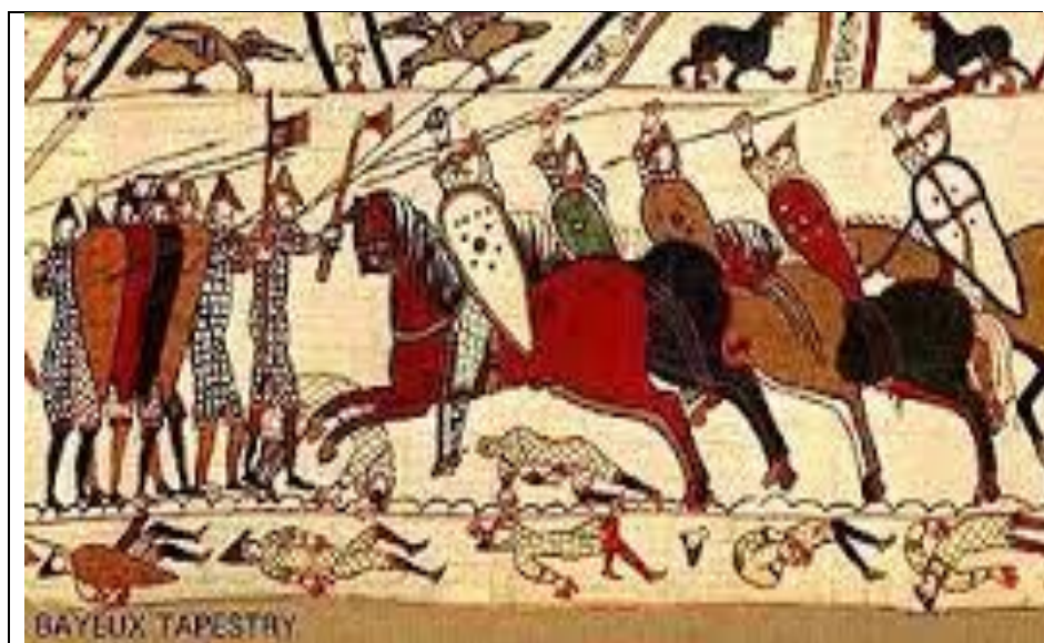
[Soldiers fighting at the Battle of Hastings in 1066]