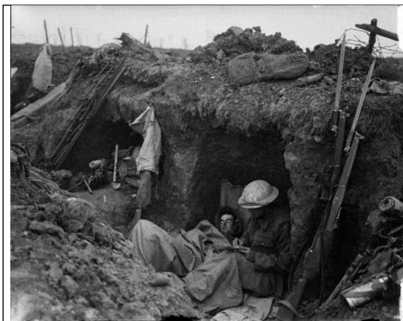
[Welsh soldiers in a trench at Mametz Wood in 1916]

Use Sources A, B and C above to identify one similarity and one difference in the use of tactics in battle over time. [4]