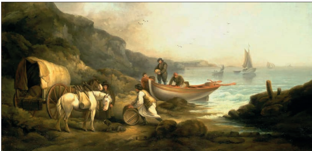
[A painting of smugglers in the late eighteenth century]