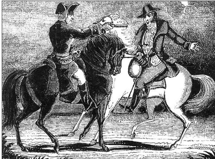
[An illustration showing a highway robbery in the early eighteenth century]