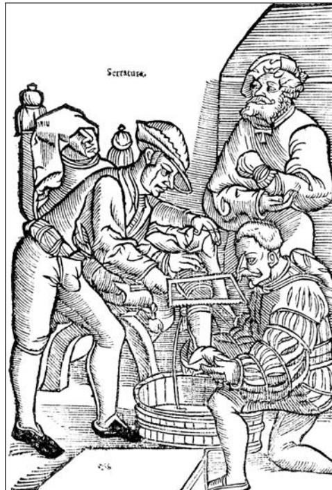
[An operation in the 16 th century]