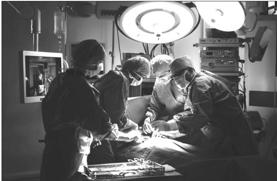
[An operation in the early 21 st century]

Use Sources A, B and C to identify one similarity and one difference in attempts to treat illness and disease over time.