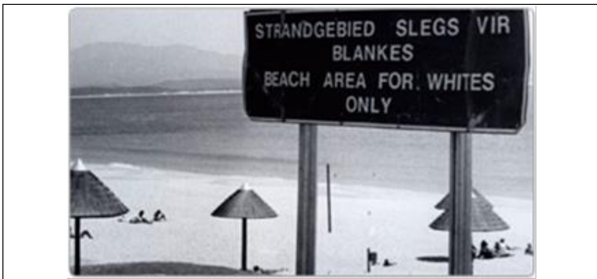
[A photograph of a beach in Durban, South Africa, in the 1950s]

Use Source A and your own knowledge to describe how apartheid affected the lives of black people. [6]