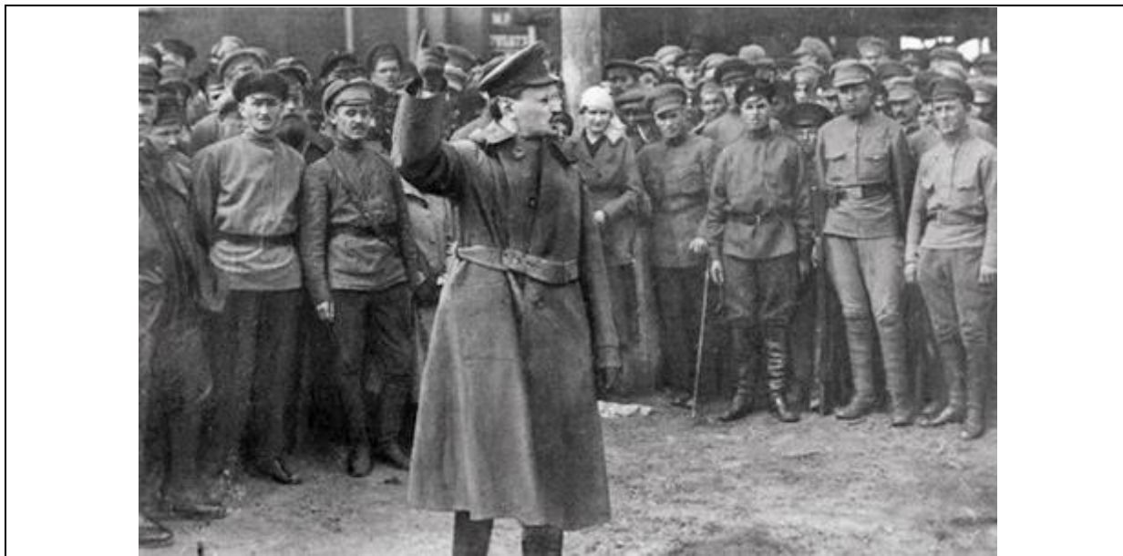
[A picture showing Trotsky addressing soldiers during the Civil War in Russia]

Use Source A and your own knowledge to outline the role of Trotsky during the Civil War. [6]