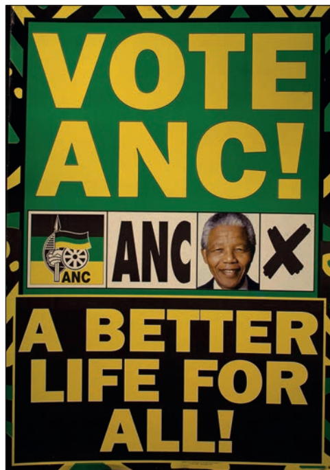
[Election posters produced for the General Election campaign in 1994. On the left, the poster states “Mandela for President. The People’s Choice” and on the right “Vote ANC. A better life for all!”.]

Use Source A and your own knowledge to describe the events leading towards the end of the apartheid system. [6]