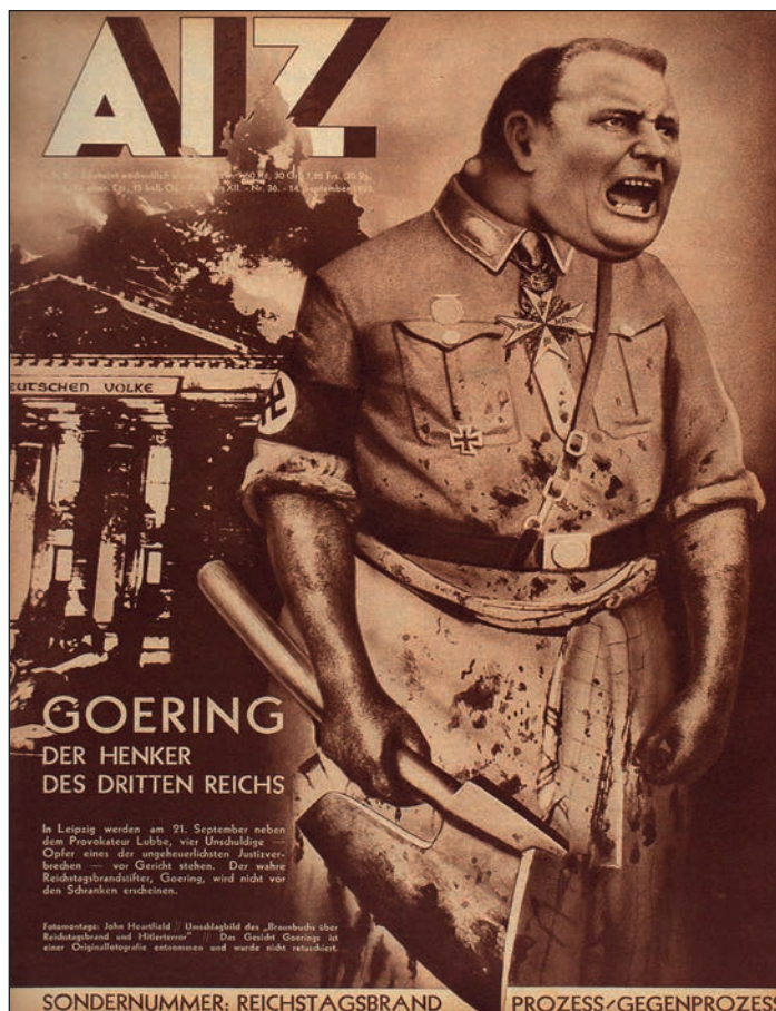
[An edition of the anti-Nazi newspaper AIZ published in 1933. It shows Goering outside the burning Reichstag, with the caption "Goering: Der Henker des Dritten Reichs" (Goering: The Butcher of the Third Reich).]