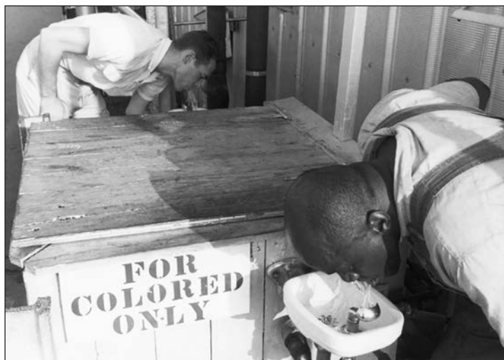
[A photograph showing public amenities in the US in the 1920s. The inscription states "For colored only".]

Use Source A and your own knowledge to describe the treatment of black Americans during this period. [6]