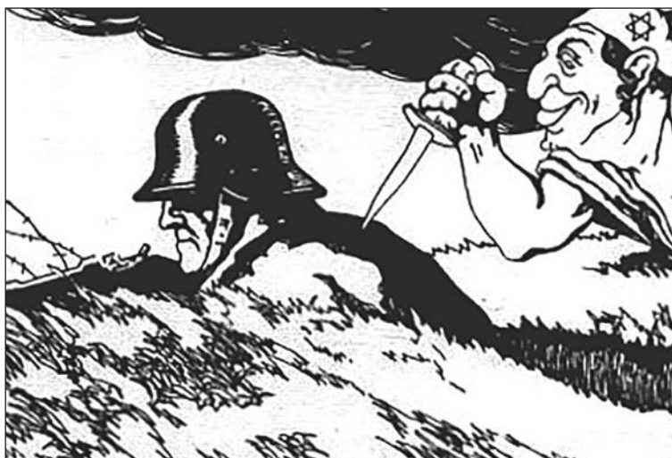
[A cartoon published in a nationalist German newspaper shortly after the end of the First World War]