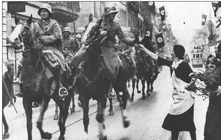
[A photograph of German troops entering the Rhineland in 1936]

Use Source A and your own knowledge to describe the German re-occupation of the Rhineland.