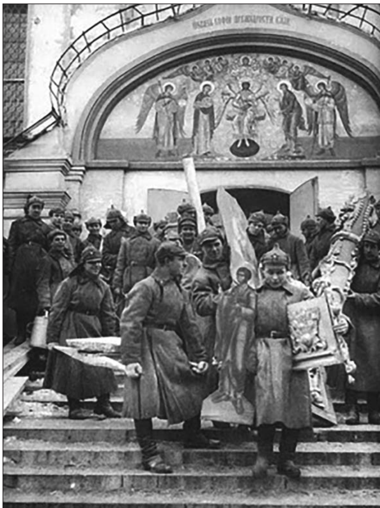
[A photograph showing Communist soldiers looting a Russian church in 1918]

Use Source A and your own knowledge to describe Communist policies towards religion. [6]