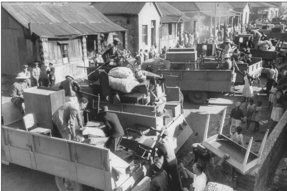
[A picture showing black South Africans leaving Sophiatown in 1955]

Use Source A and your own knowledge to describe the forced movement of black South Africans to the townships. [6]