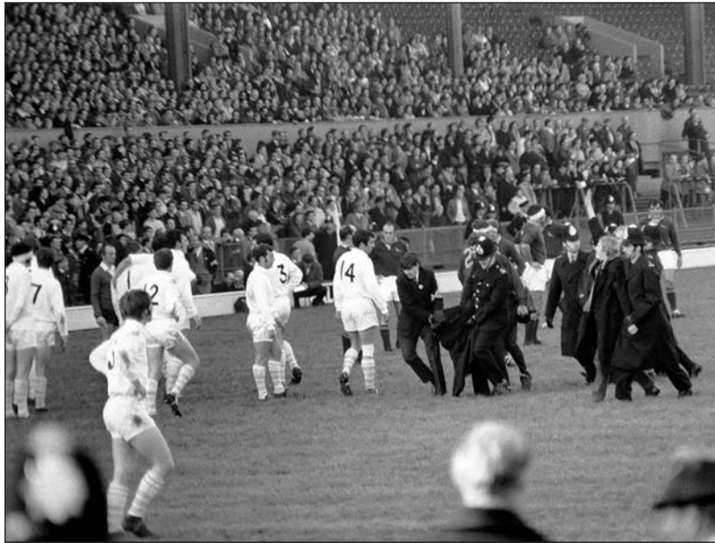
[A photograph showing demonstrators at a rugby match against the South African rugby team during their UK tour in 1969]

Use Source A and your own knowledge to describe the activities of the Anti-Apartheid Movement. [6]