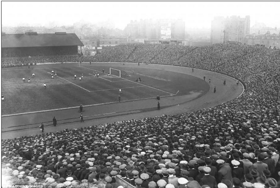
[A football match in the early 20 th century]

Use Sources A, B and C to identify one similarity and one difference in developments in sport over time. [4]