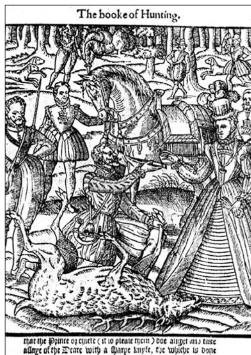
[A 16 th century hunt]