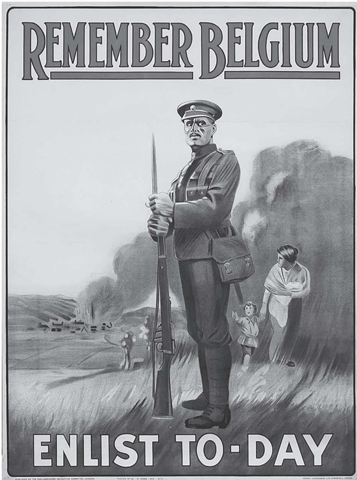
From a poster published in Britain in 1915.