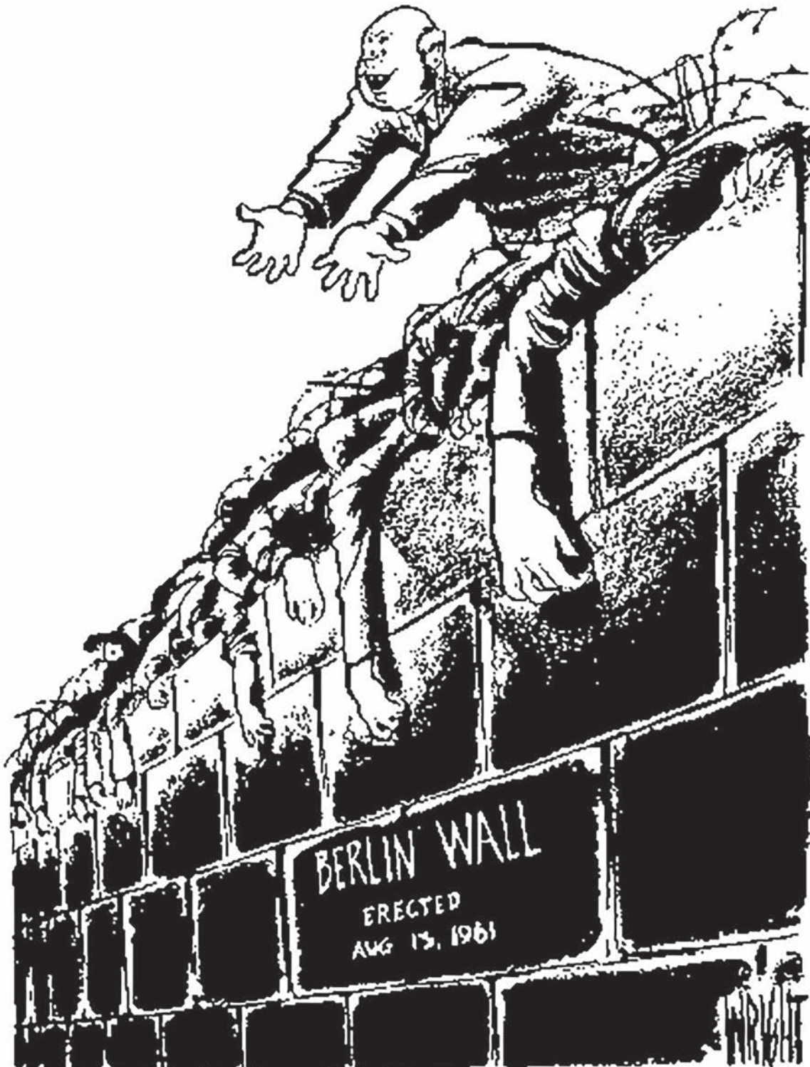
A cartoon published in an American newspaper in 1961 soon after the construction of the Berlin Wall. The figure at the top represents Khrushchev.