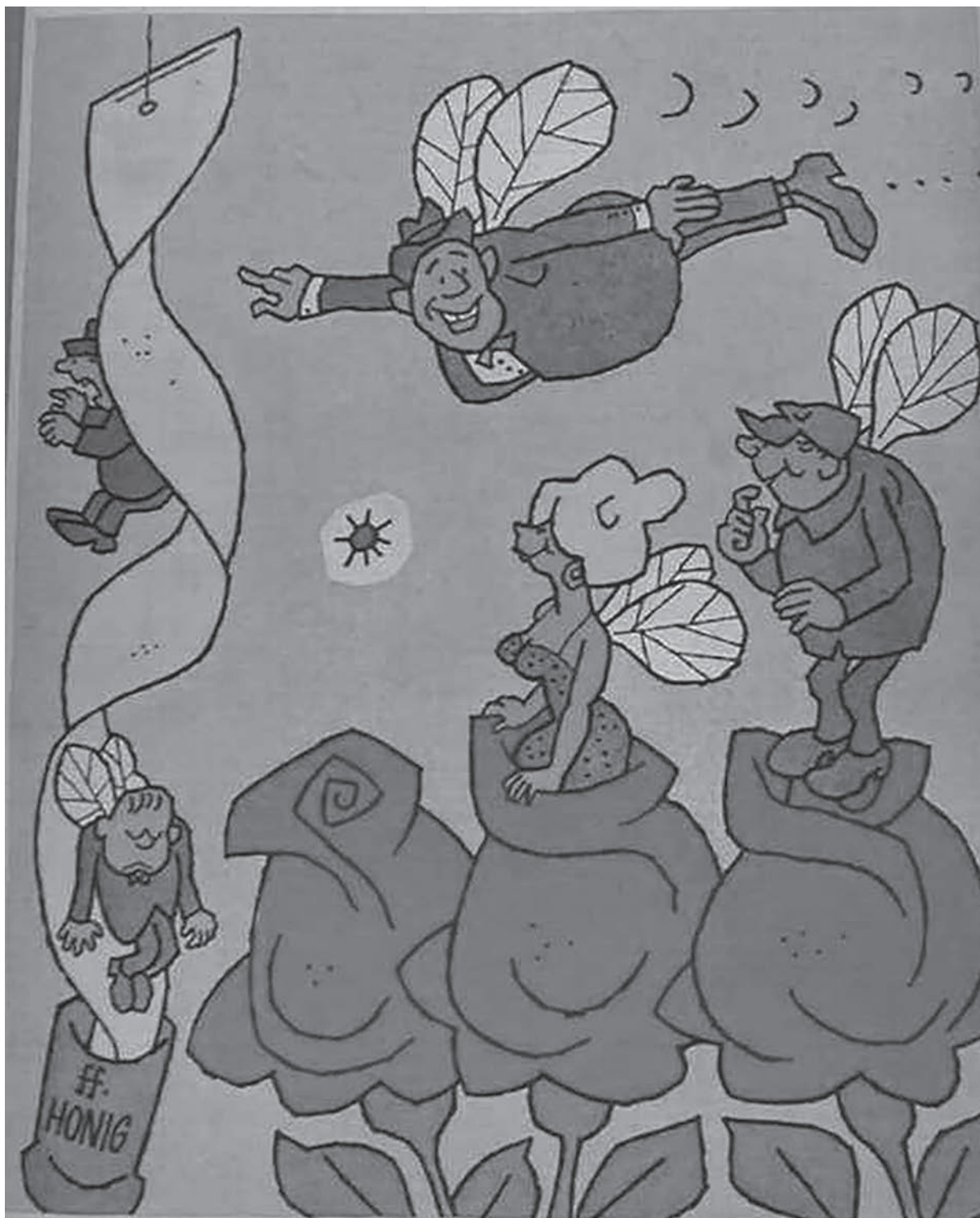
A cartoon published in an East German magazine in August 1961, just before the building of the Berlin Wall. 'Honig' means 'Honey'. The cartoon shows an East German worker flying to West Berlin, while the two on the left have arrived. The two East Germans on the right have stayed in East Germany.