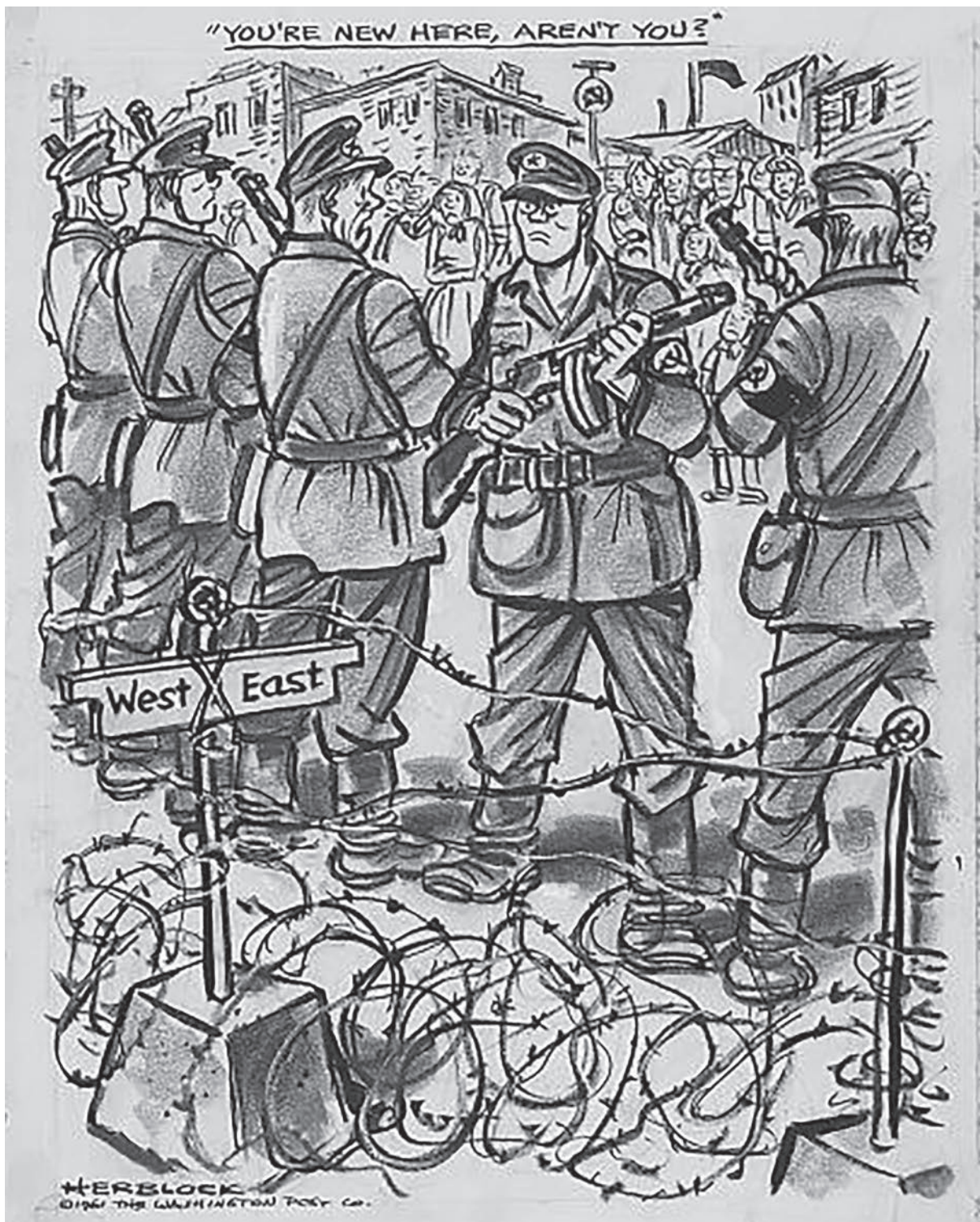
A cartoon published in an American newspaper, 30 August 1961.