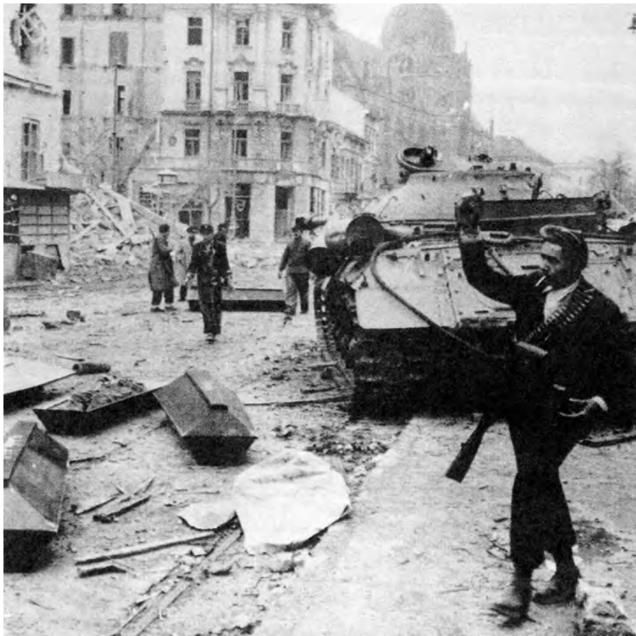
A photograph taken during the Soviet army's invasion of Hungary in 1956.

7 Look at the photograph, and then answer the questions which follow.