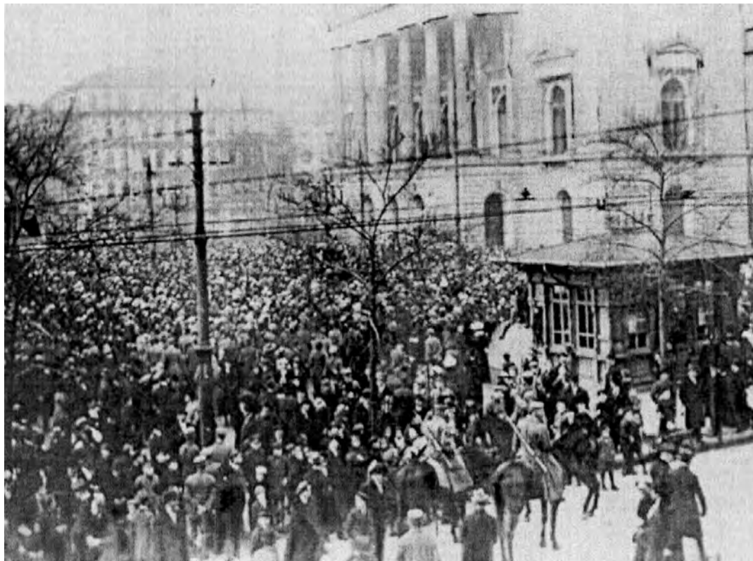
A photograph taken in Berlin in 1920 during the general strike.