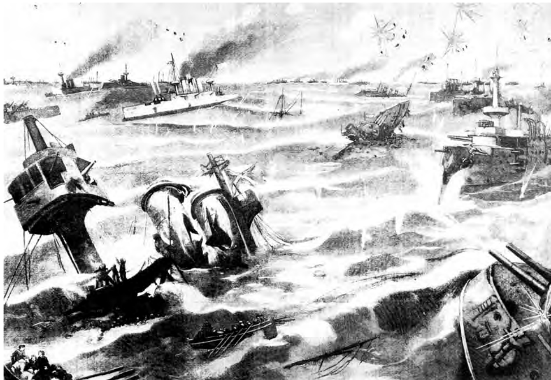
An illustration of the Battle of Tsushima Straits in which the Russian Baltic fleet was destroyed by the Japanese navy in May 1905.