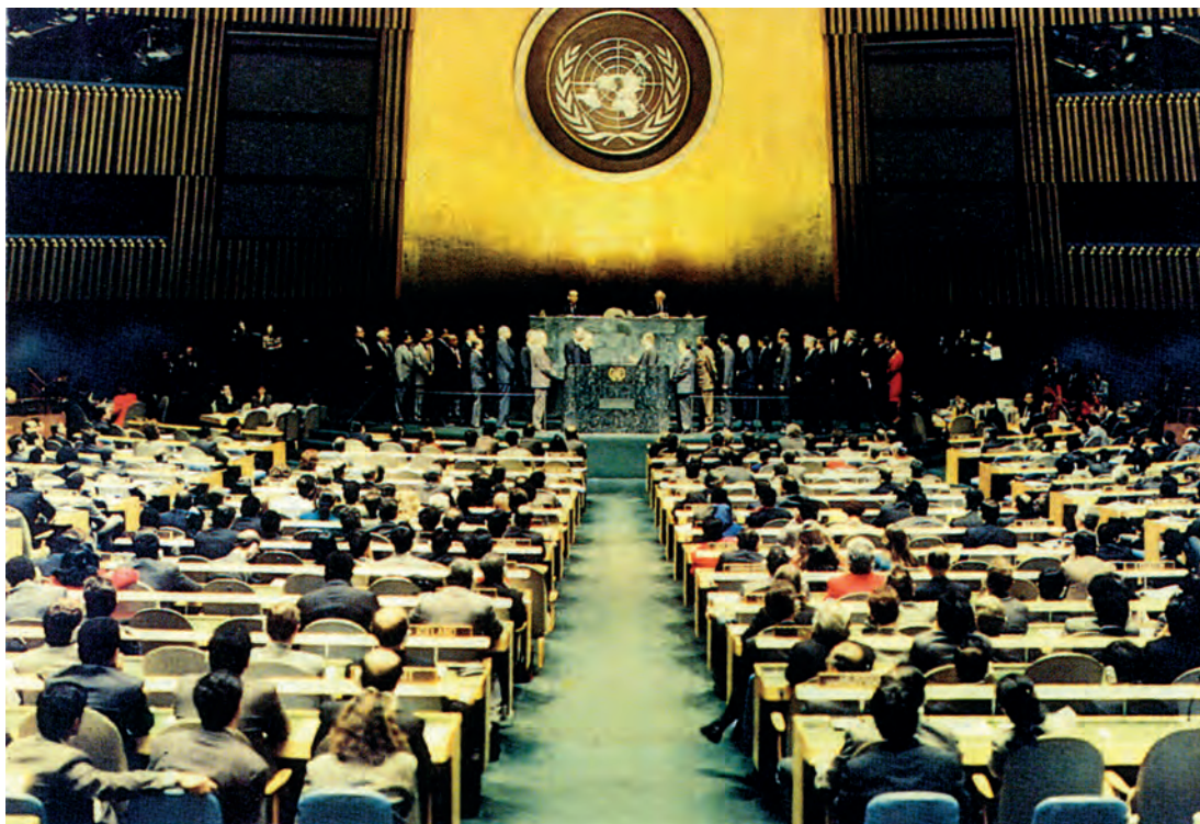
A photograph of the General Assembly of the United Nations in session.