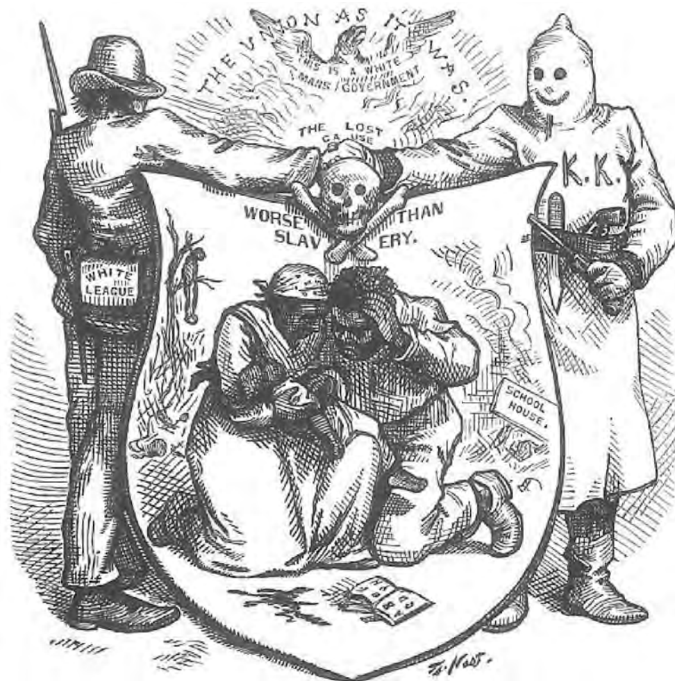
An American cartoon showing the relationship of the White League and the Ku Klux Klan.