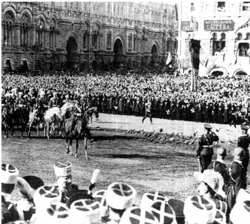
A photograph of Tsar Nicholas II at the 1913 celebrations of 300 years of Romanov rule. This was the first time since 1905 that he had appeared in public.

11 Look at the photograph, and then answer the questions which follow.