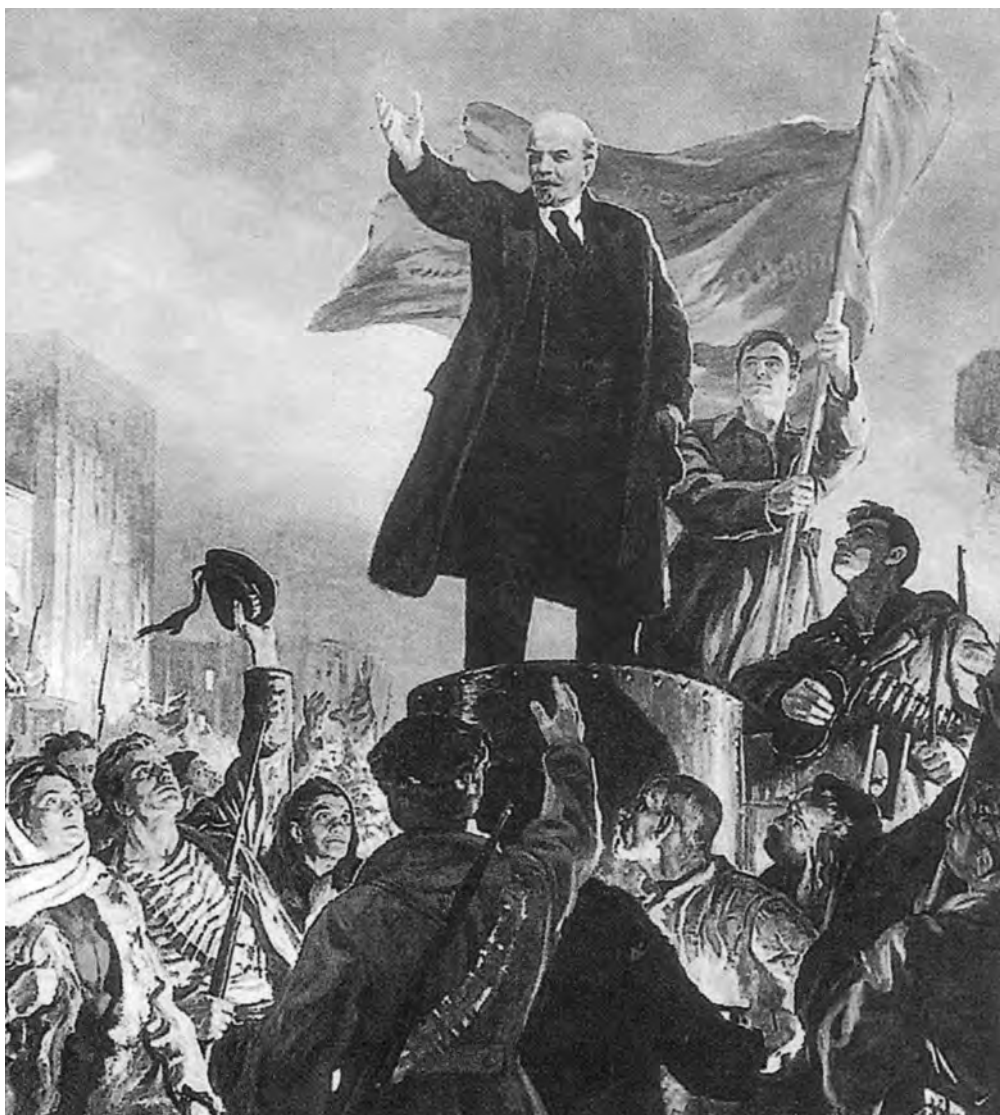
A painting of Lenin addressing a crowd on his return to Petrograd in April 1917.

11 Study the painting, and then answer the questions which follow.