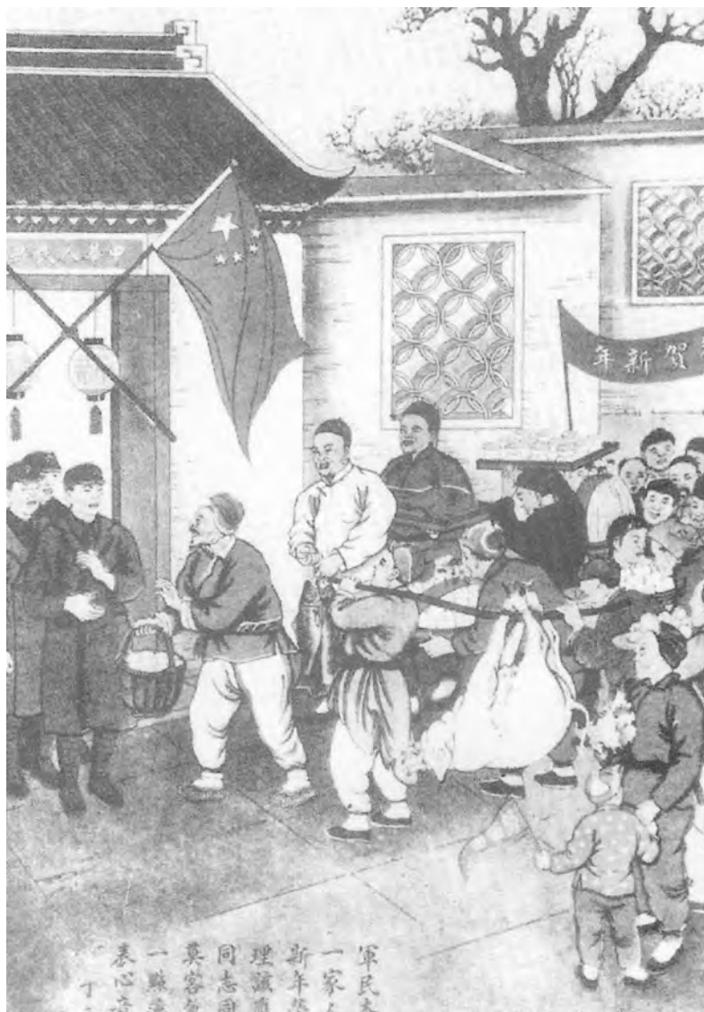
A Chinese poster published in 1950. It is showing happy relations between peasants and the People's Liberation Army.

15 Study the picture, and then answer the questions which follow.