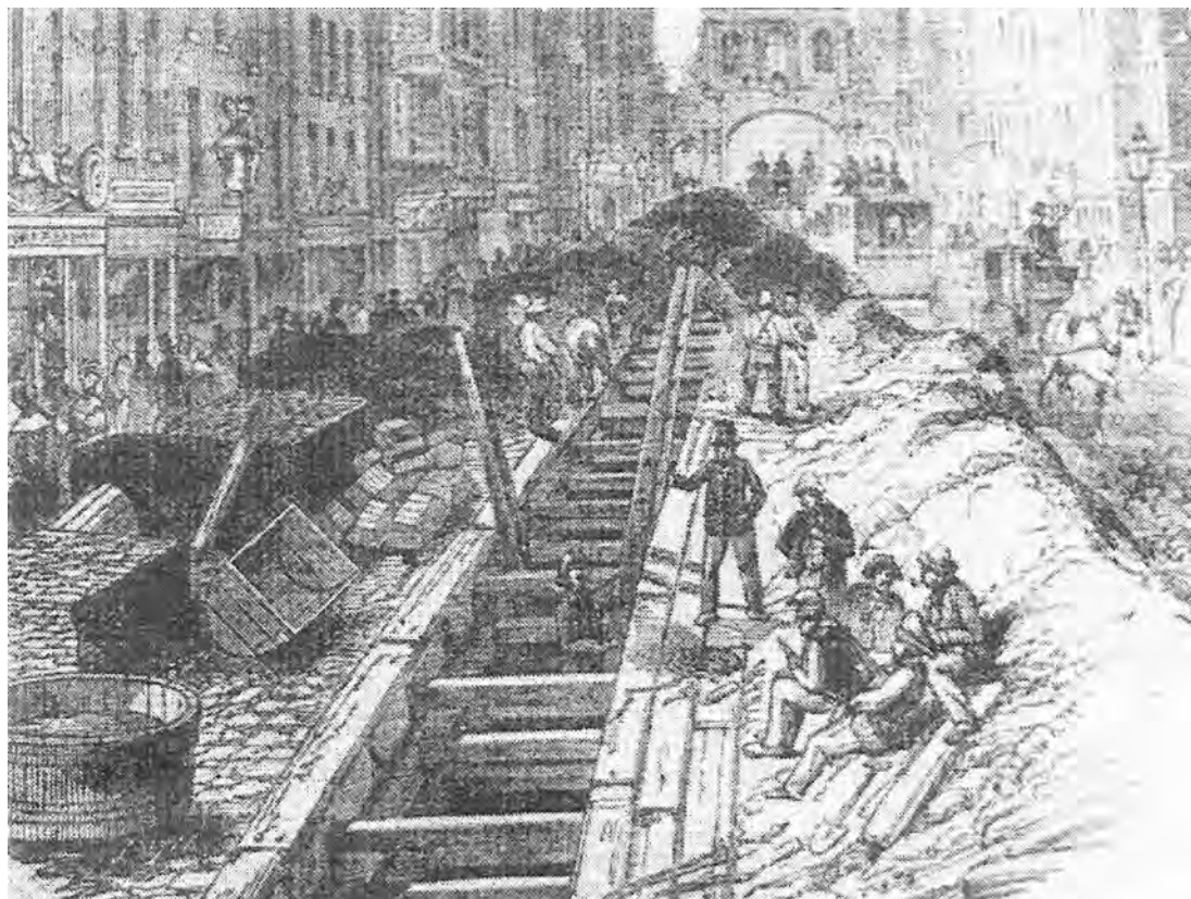
Building a sewer in London in 1844.

23 Study the illustration, and then answer the questions which follow.