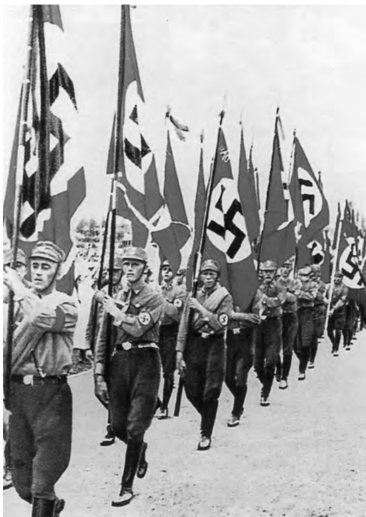
The SA parading at Nuremberg in 1933.