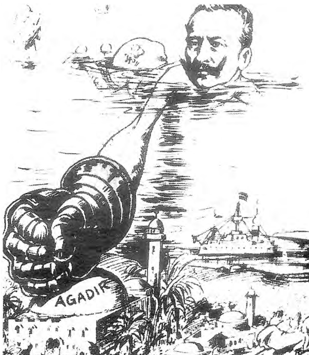
A cartoon about the Agadir crisis, published in 1911.

4 Study the cartoon, and then answer the questions which follow.