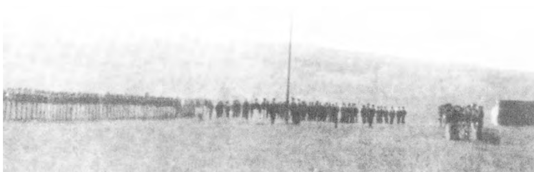
Hoisting the German flag at Angra Pequena, August 1884.

19 Study the photograph, and then answer the questions which follow.