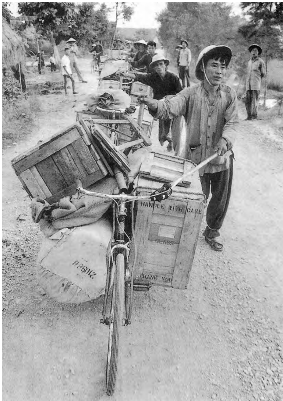
A Vietcong supply convoy.

7 Study the photograph, and then answer the questions which follow.