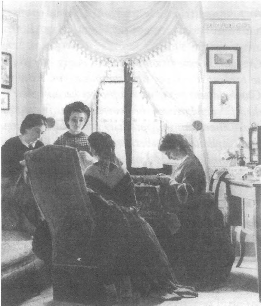
A picture entitled 'The Sewing of Red Shirts' showing women preparing shirts for volunteers in Garibaldi's army.

2 Study the picture, and then answer the questions which follow.