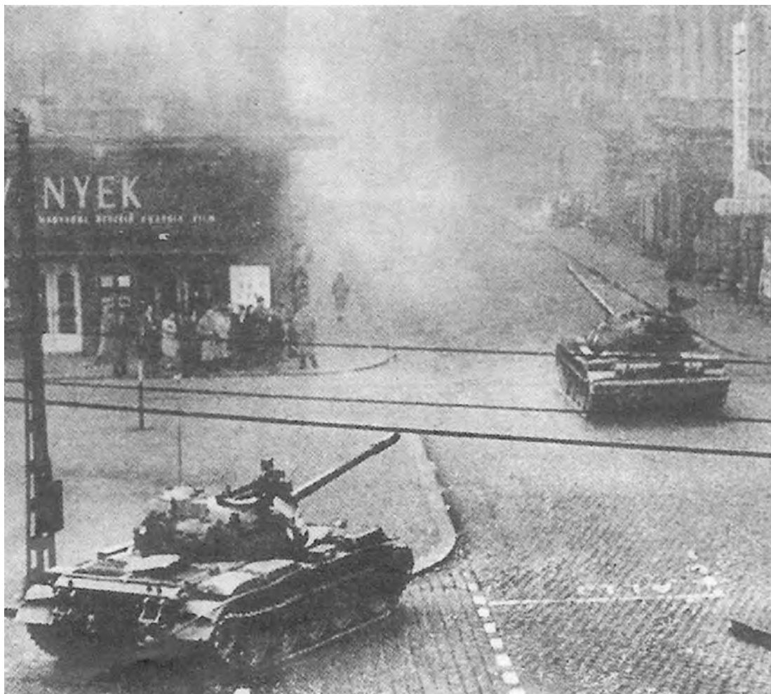
Soviet tanks in the centre of Budapest, November 1956.

8 Study the photograph, and then answer the questions which follow.