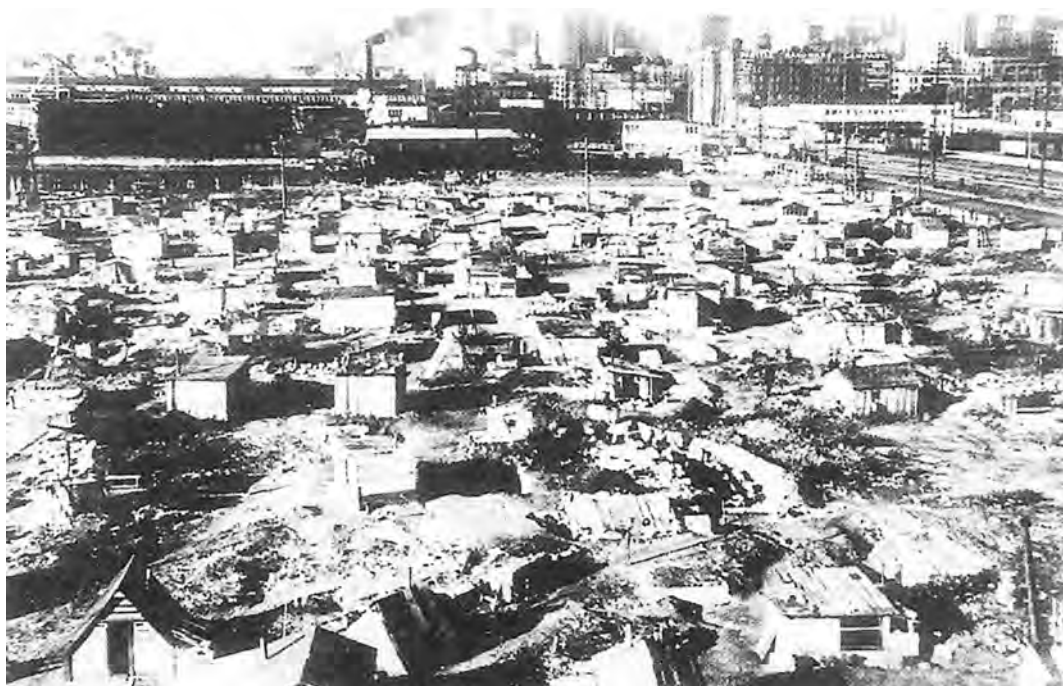
A Hooverville shanty town on wasteland in Seattle, Washington.

14 Study the photograph, and then answer the questions which follow.