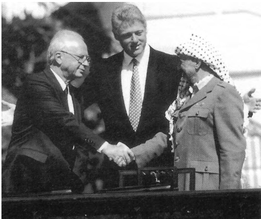
Rabin and Arafat shake hands while US President Clinton looks on, 1993.

20 Study the photograph, and then answer the questions which follow.