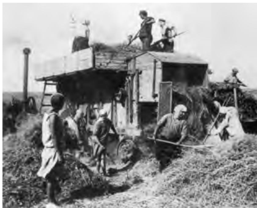
Threshing on a collective farm.

12 Study the photograph, and then answer the questions which follow.