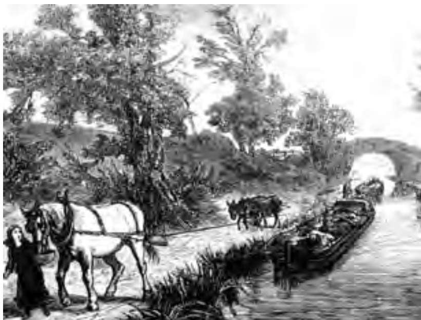
An early nineteenth-century drawing of canal barges.

22 Study the picture, and then answer the questions which follow.