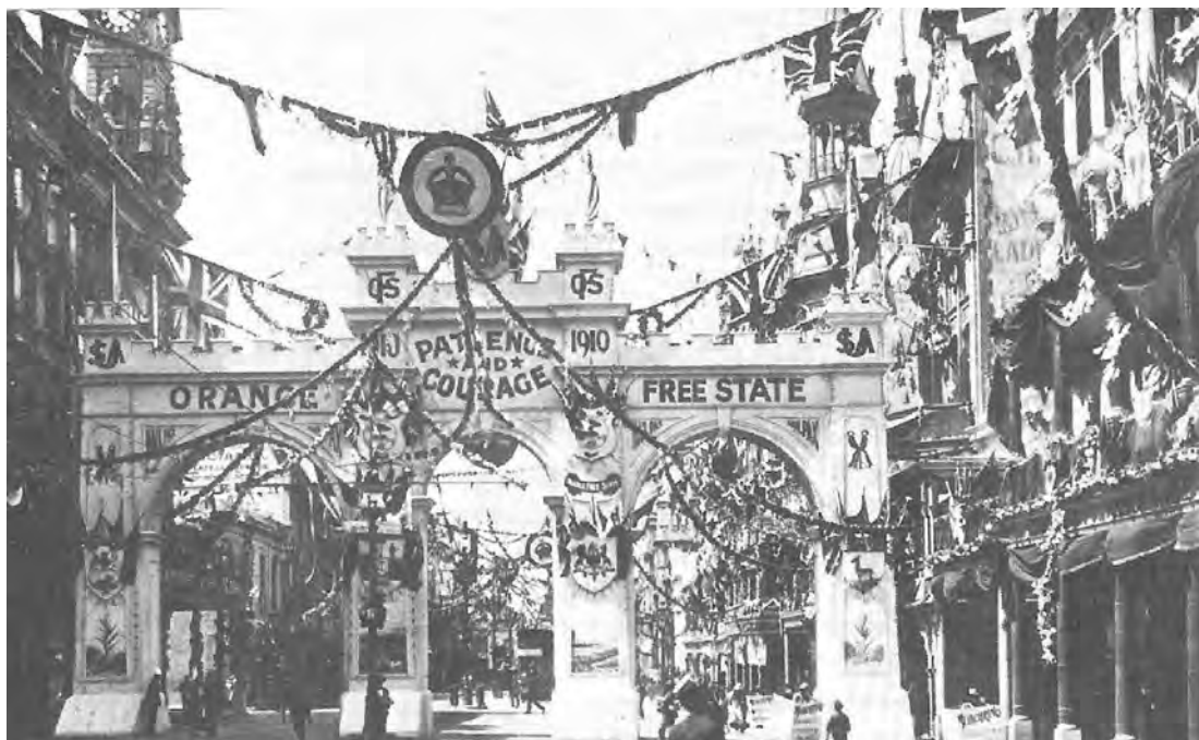
A photograph showing celebrations in South Africa on the creation of the Union, 1910.

17 Study the photograph, and then answer the questions which follow.