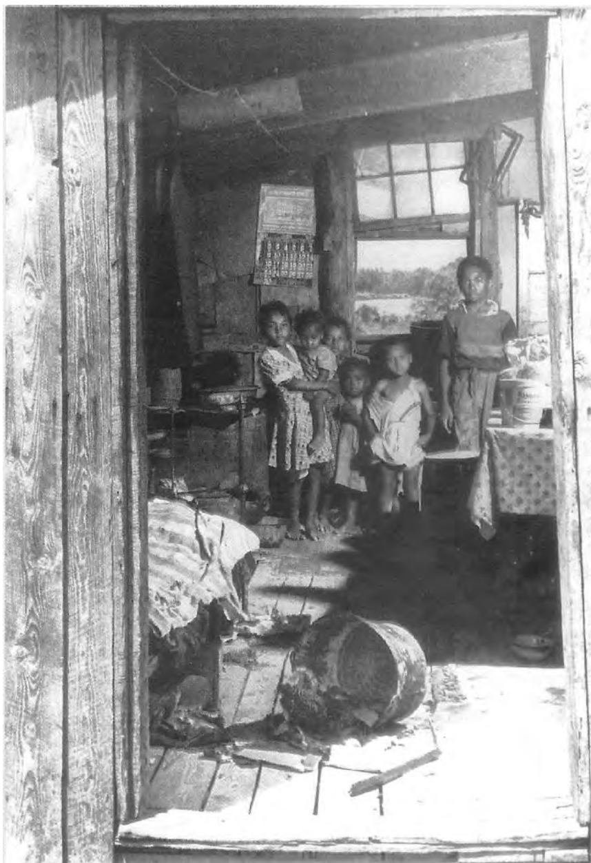
A family home in the Southern state of Virginia.

13 Study the illustration, and then answer the questions which follow.