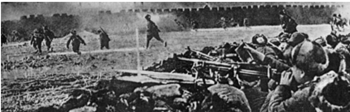
A photograph of Communist troops advancing in the Civil War.

15 Study the photograph, and then answer the questions which follow.