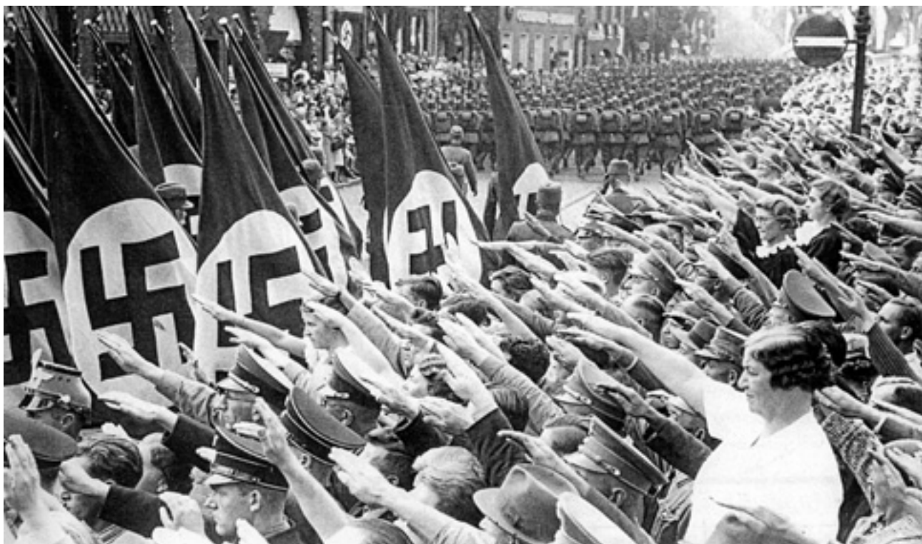
Crowds at the 1936 Nazi Party rally in Nuremberg.

10 Study the picture, and then answer the questions which follow.