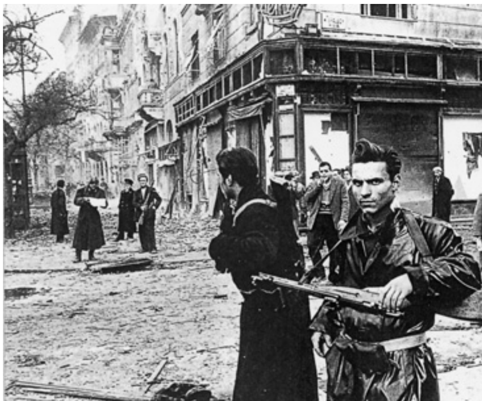
Hungarian rebels in Budapest, November 1956.