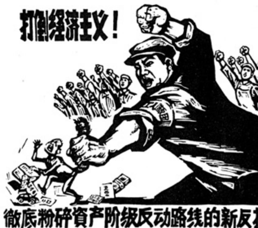
The Red Guards dealing with opponents during the Cultural Revolution.

16 Study the cartoon, and then answer the questions which follow.