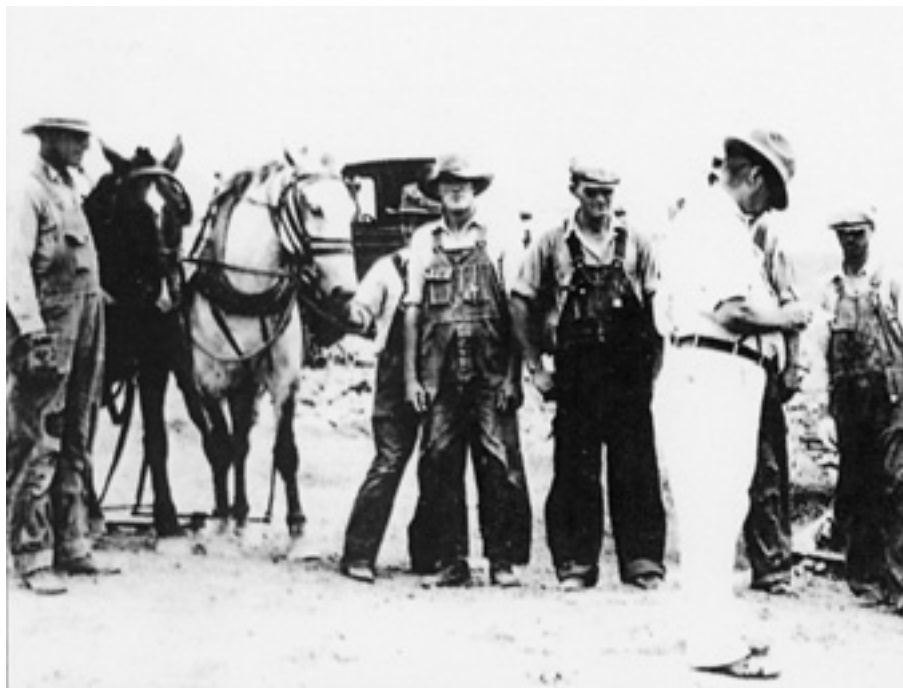
Unemployed farm workers in the 1920s.

13 Study the picture, and then answer the questions which follow.