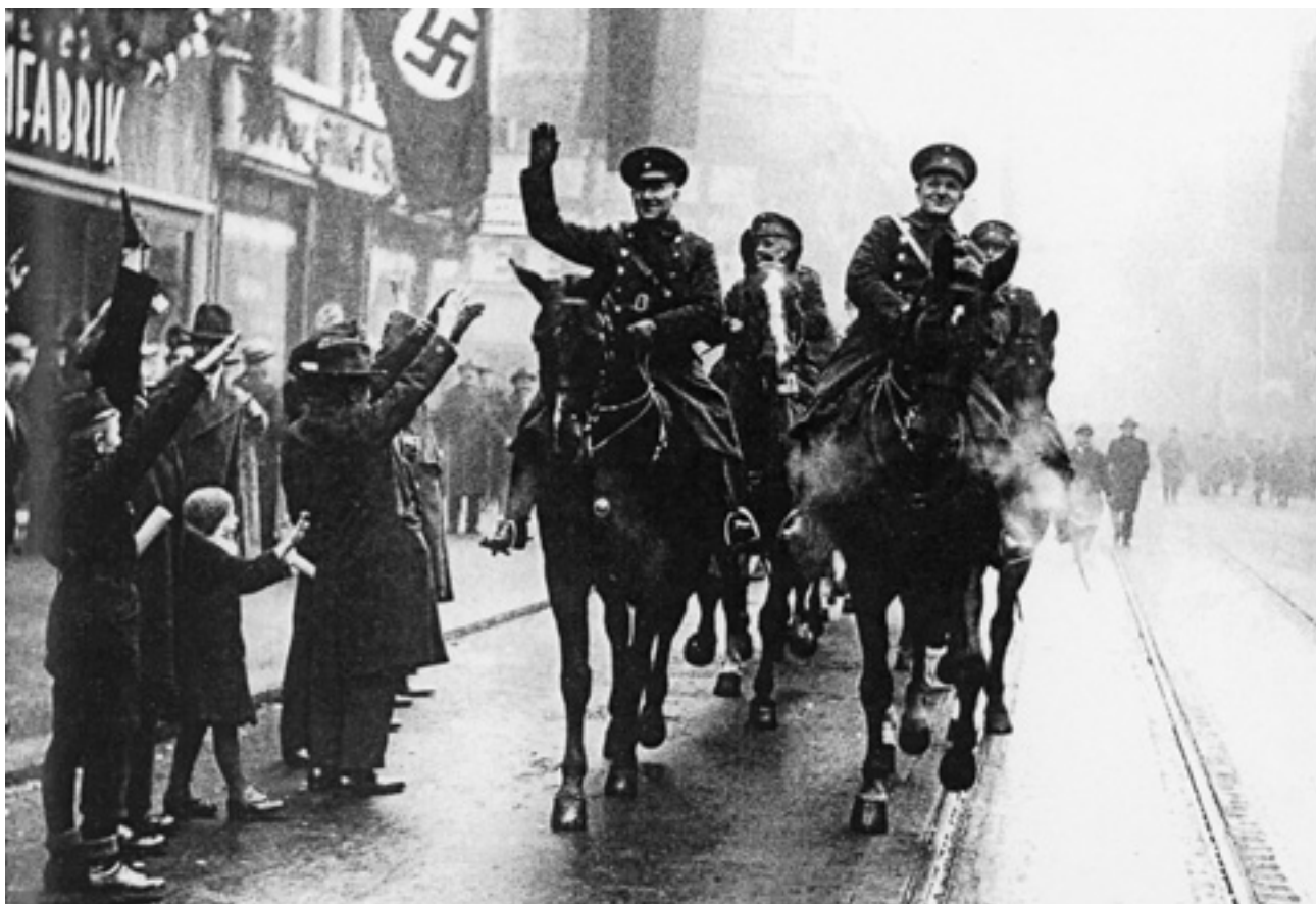
People in the Saar celebrating the results of the 1935 plebiscite.

6 Study the photograph, and then answer the questions which follow.