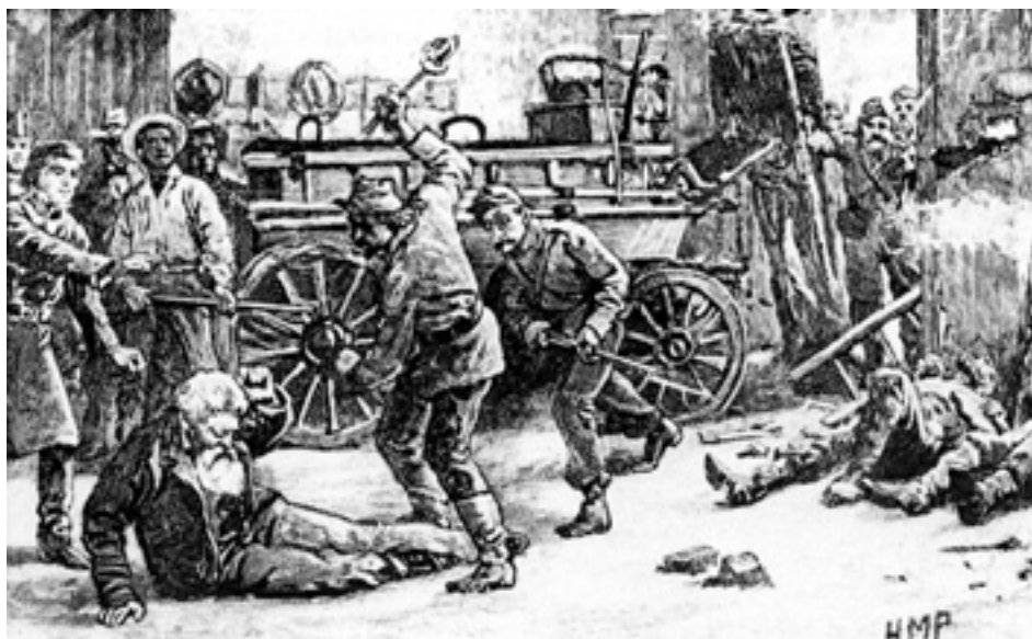
The capture of John Brown at Harper's Ferry, 1859.

3 Study the picture, and then answer the questions which follow.