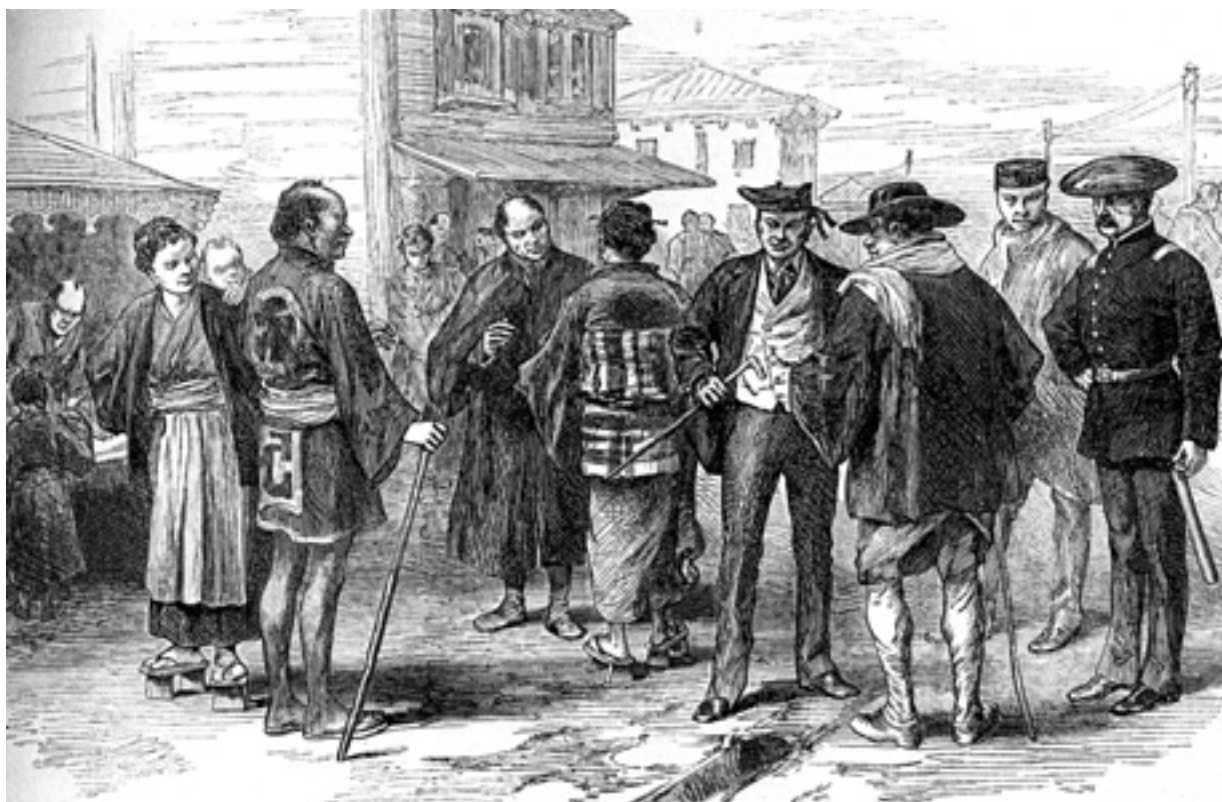
Traditional and western costume in Japan, 1873.