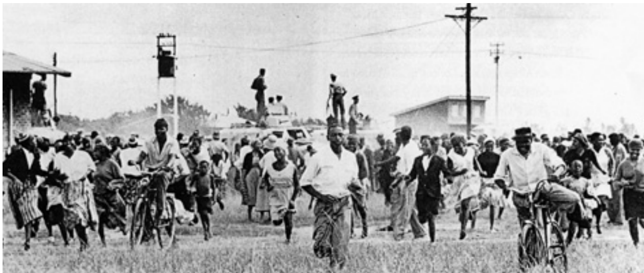
Protesters fleeing from the bullets at Sharpeville, 1960.

17 Study the picture, and then answer the questions which follow.