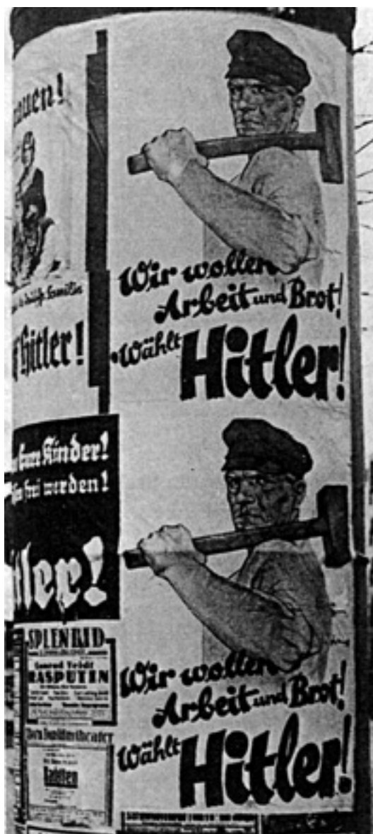
A 1932 election poster. It says 'We want work and bread. Elect Hitler'.