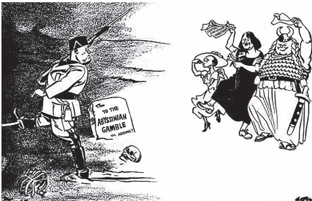
THE GIRLS HE LEFT BEHIND HIM

A British cartoon published in May 1935. The figures on the right are Goebbels, Hitler and Göring.