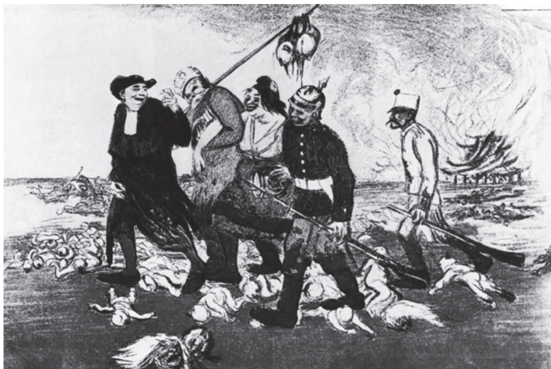
A cartoon published in a French magazine, July 1900. Its title is 'The expedition of the European powers against the Boxers'.