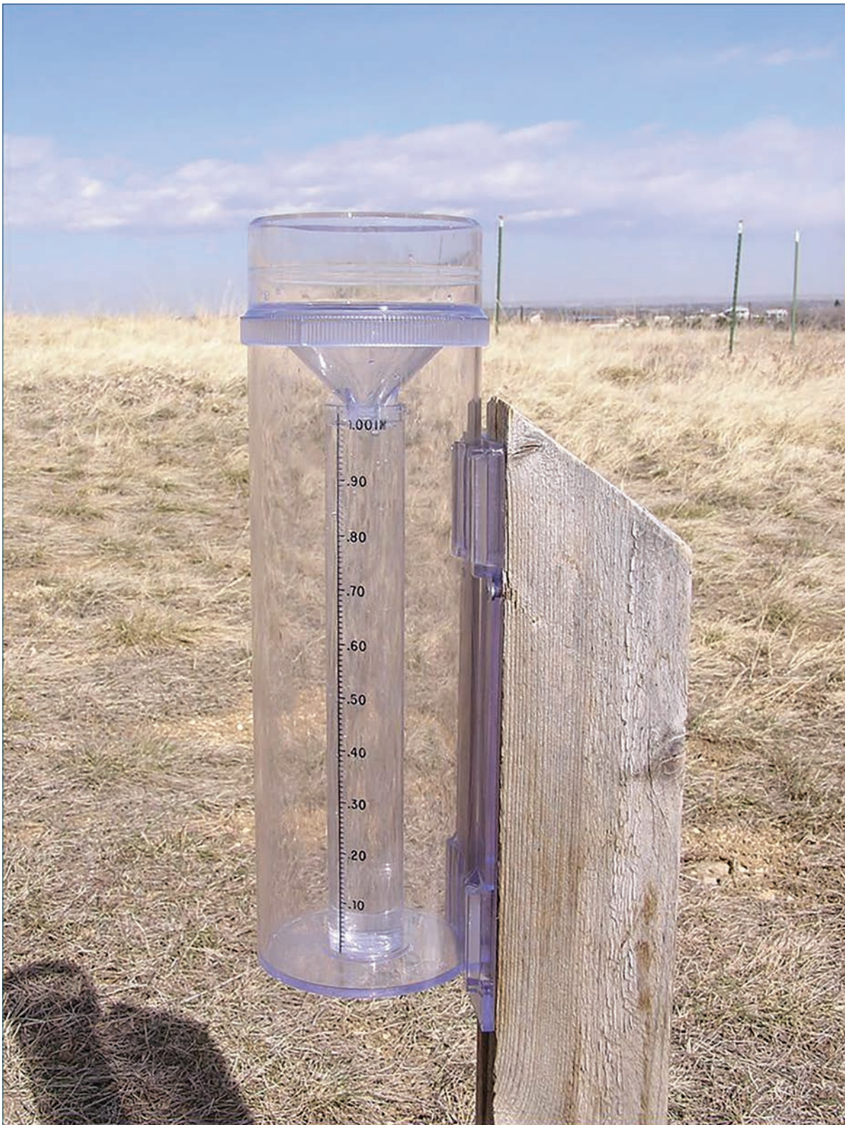
An instrument to measure rainfall