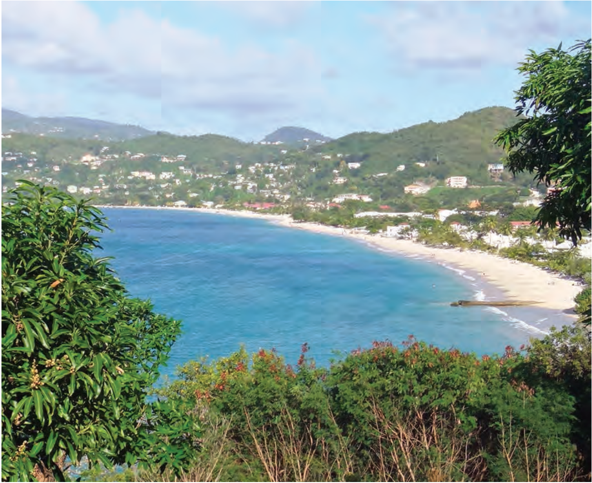
Photograph A for Question 2