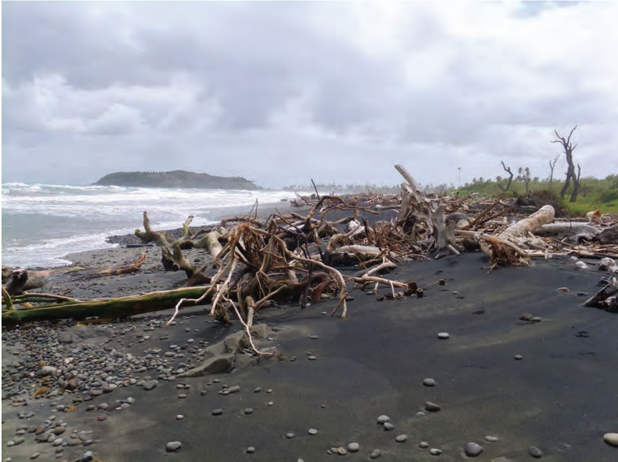
Photograph B for Question 2