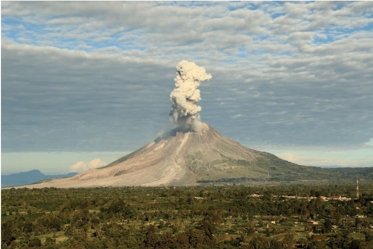
Fig. 3.1 for Question 3