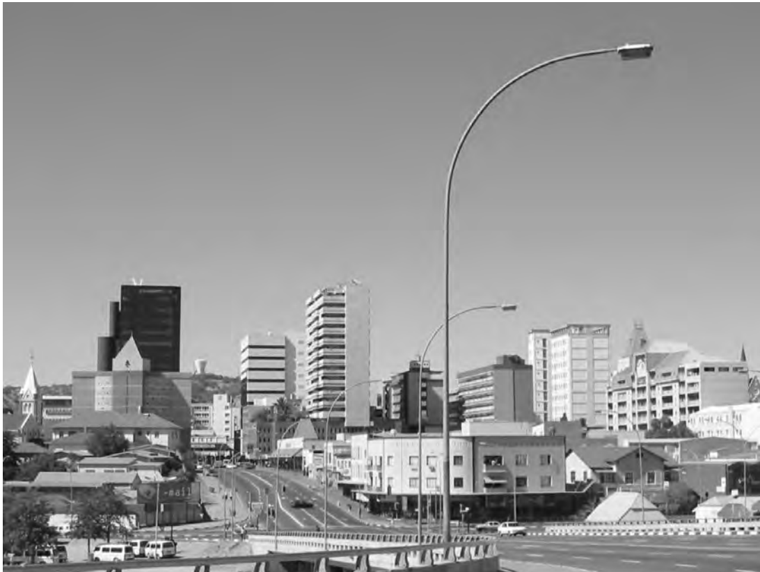
Photograph A for Question 7