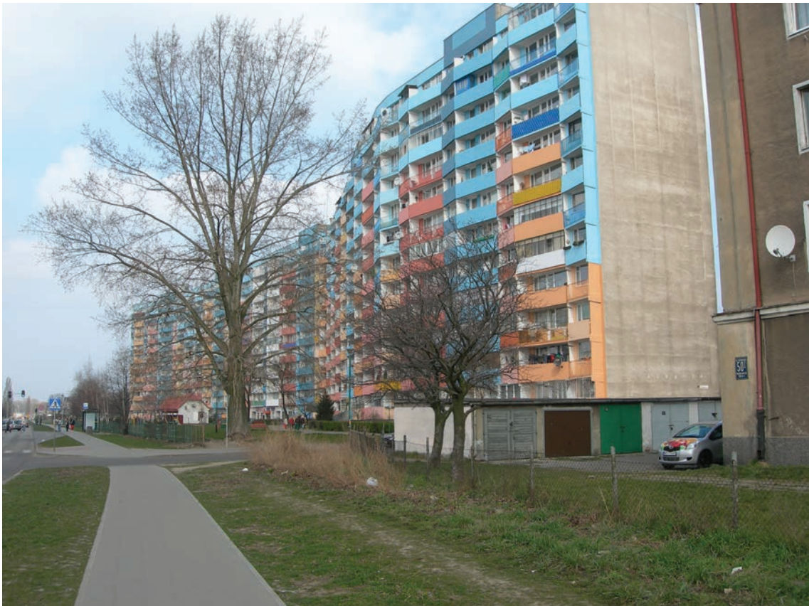
Fig. 2.2 for Question 2