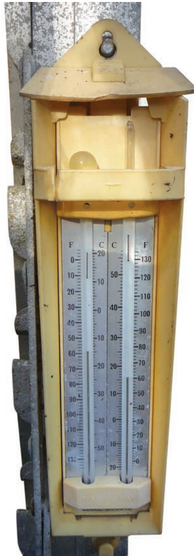
Fig. 4.2 for Question 4