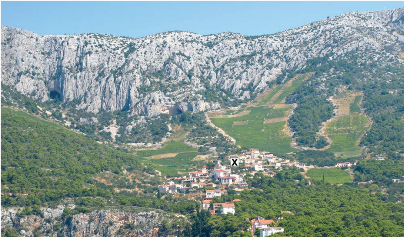
Fig. 2.1 for Question 2