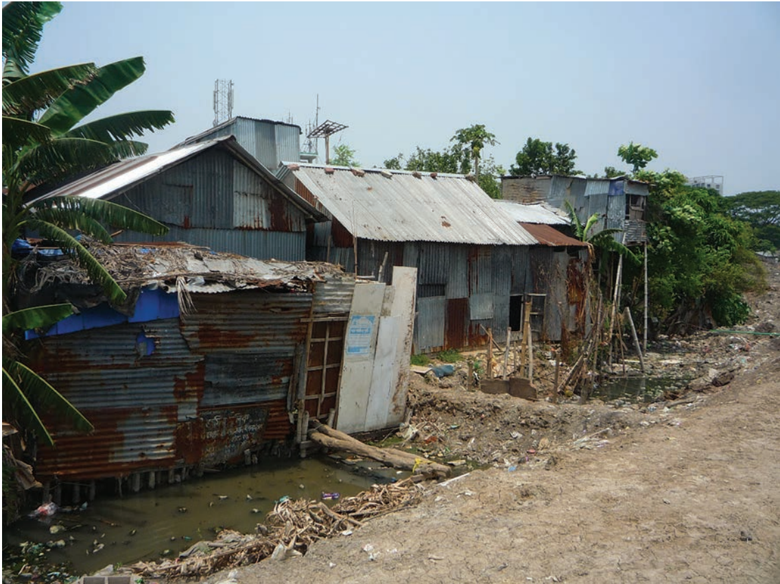
Fig. 2.2 for Question 2