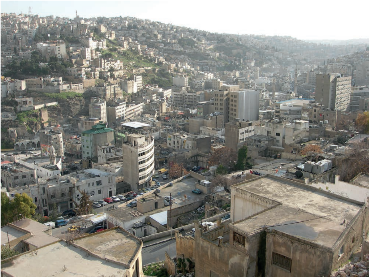
Fig. 1.2 for Question 1