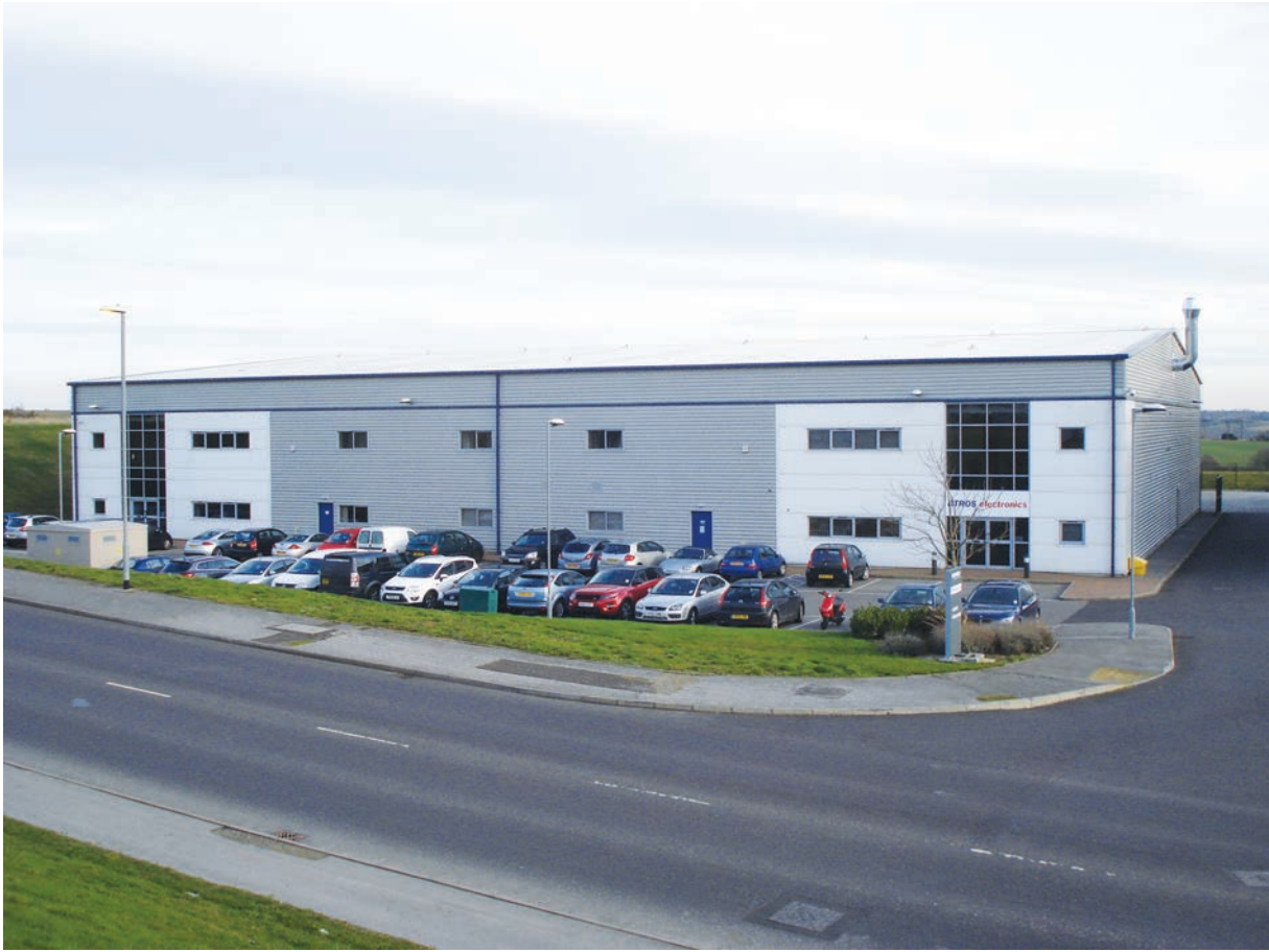
Fig. 6.3 for Question 6