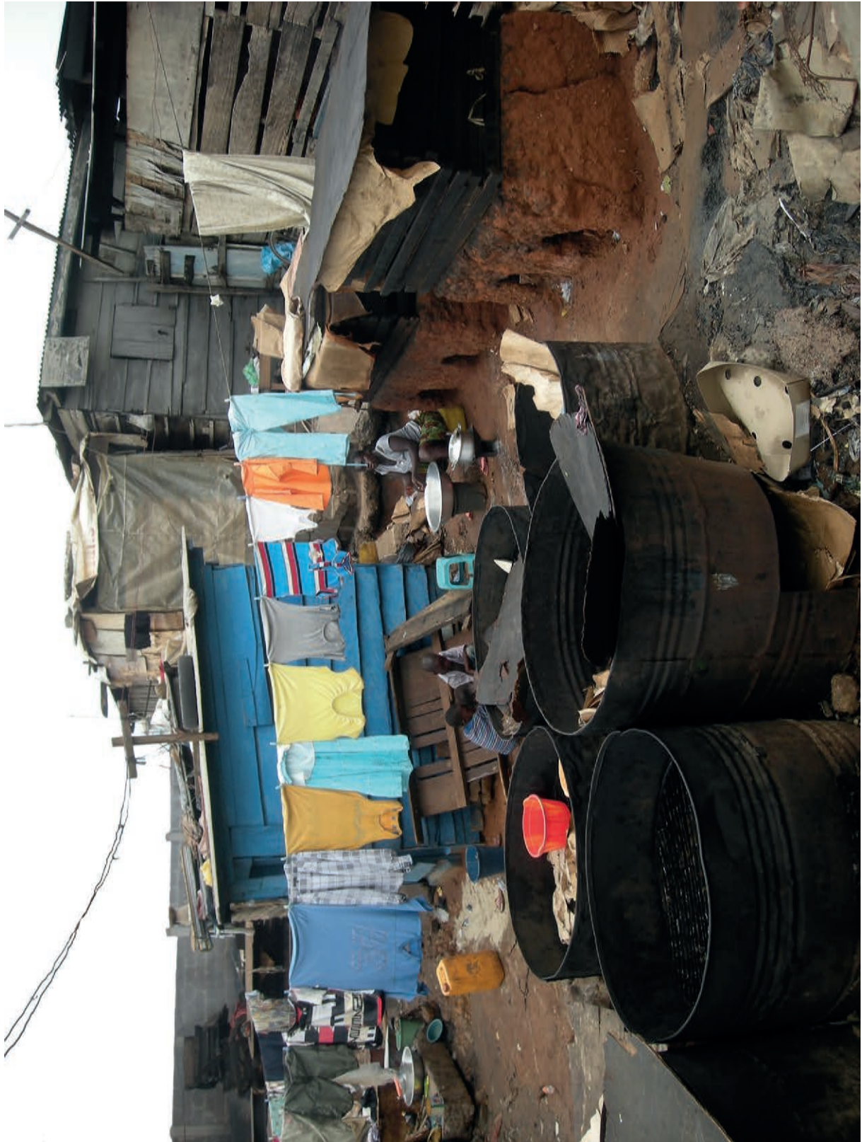
Fig. 2.2 for Question 2