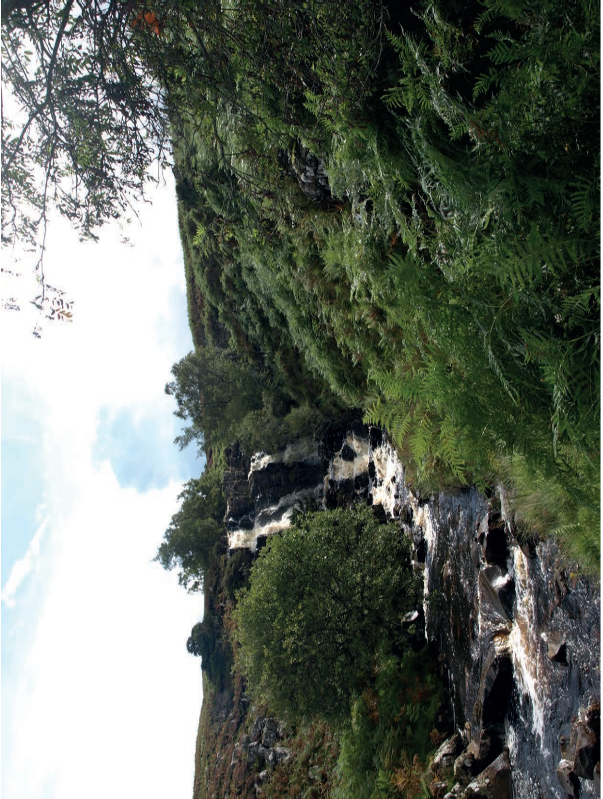
Fig. 3.3 for Question 3