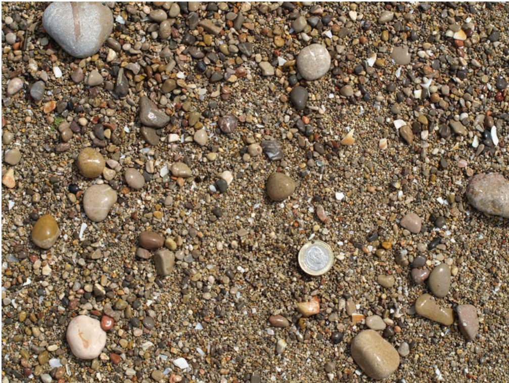
Photograph C for Question 3