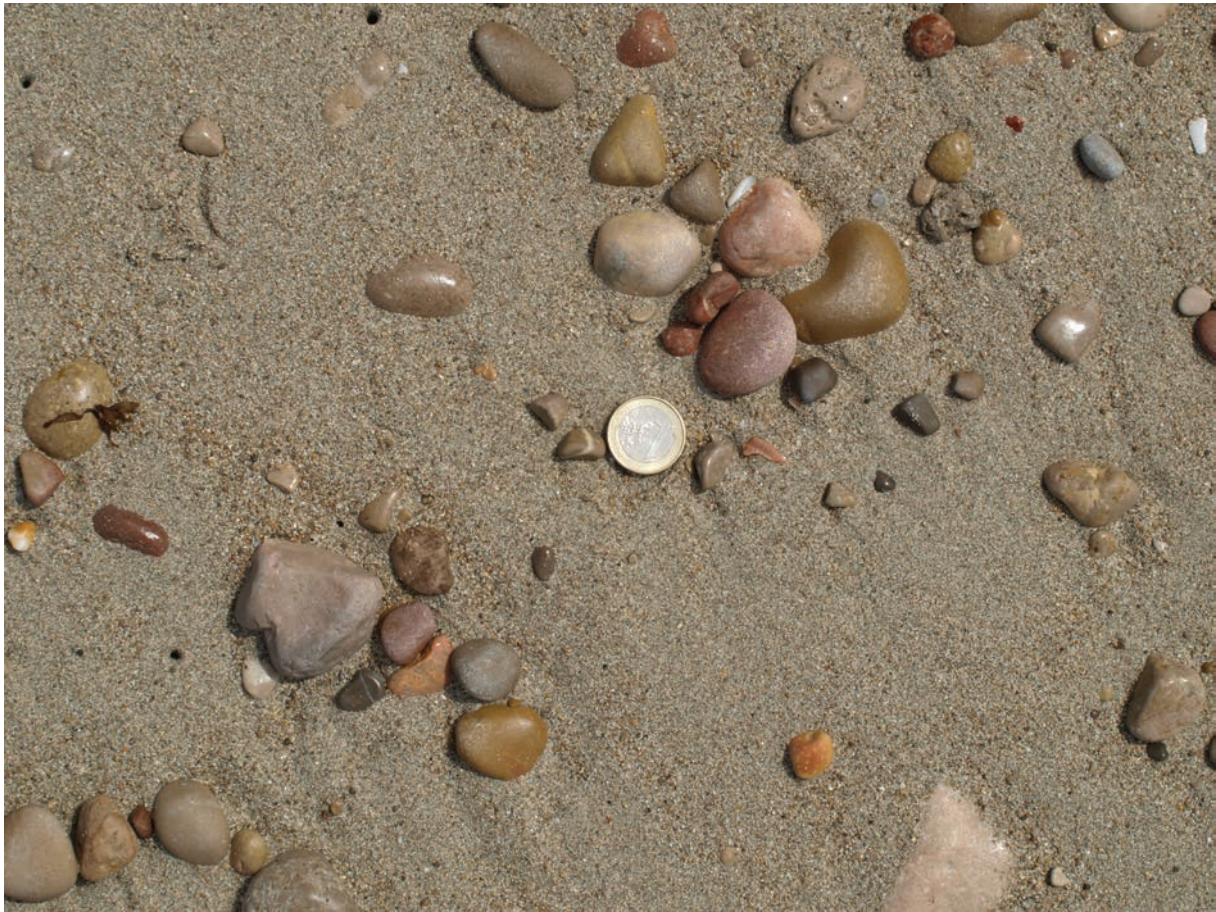
Photograph A for Question 3