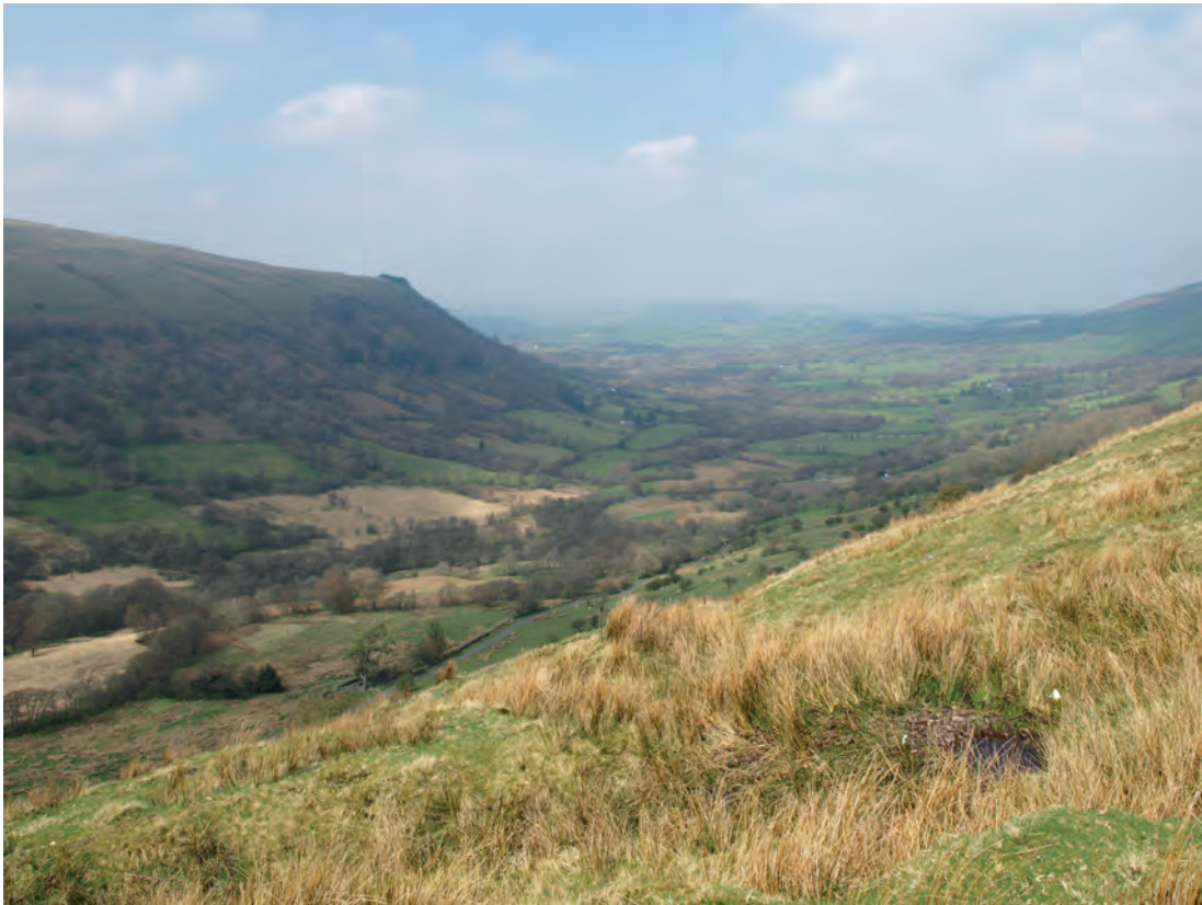
Photograph C for Question 6