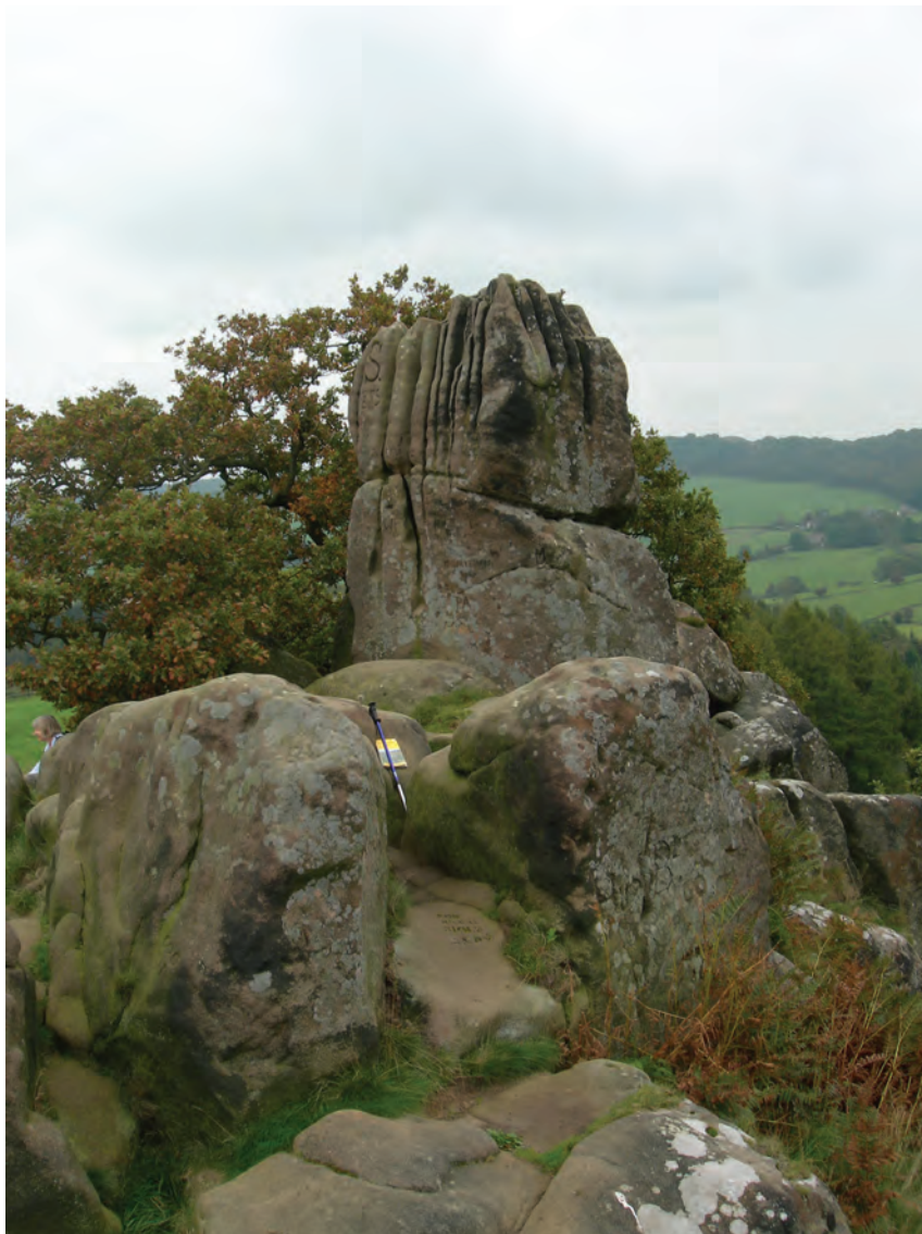
Photograph C for Question 4