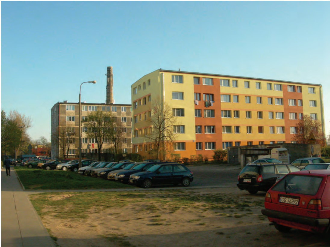
Photograph B showing area B for Question 2