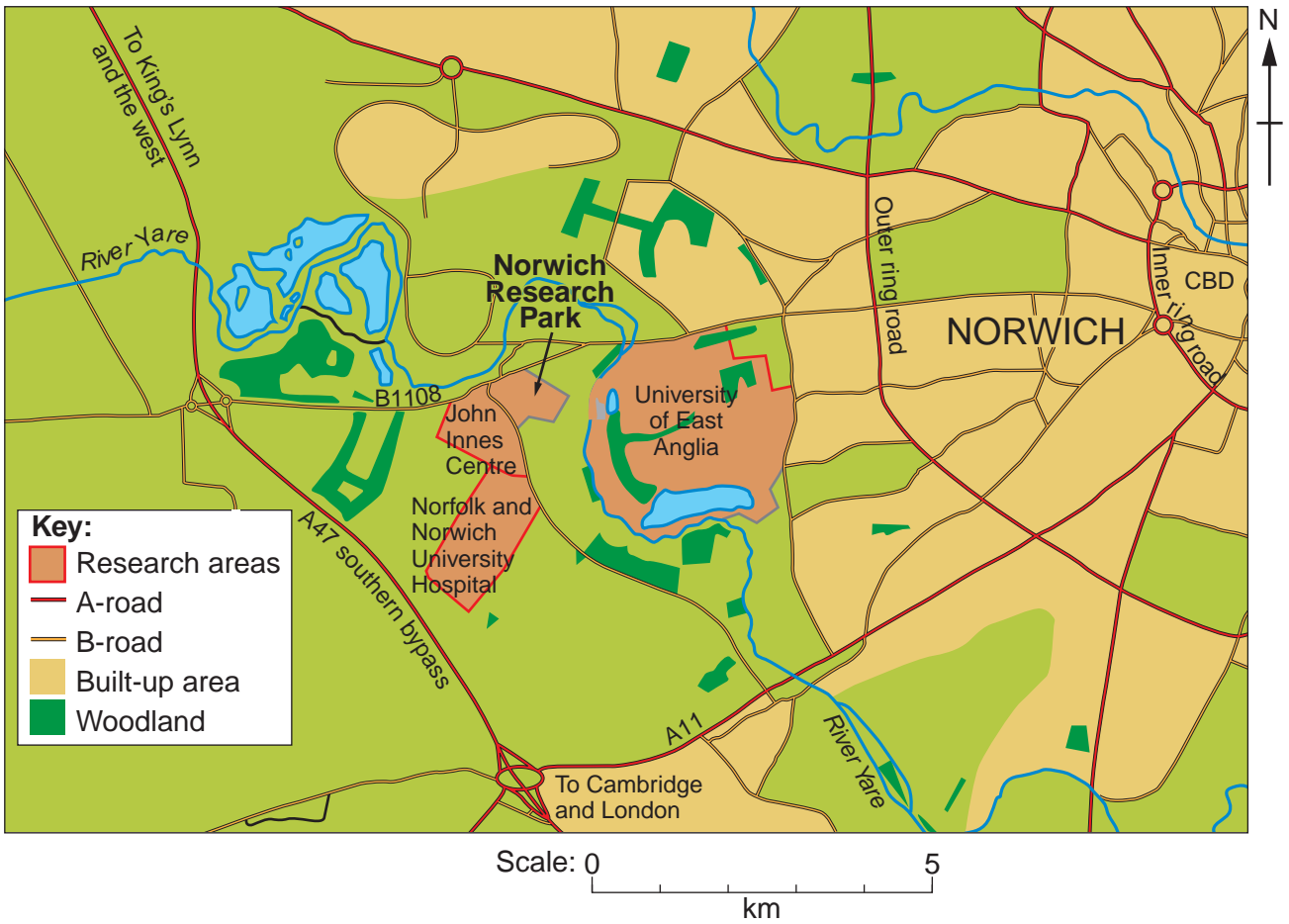
Fig. 8B for Question 5