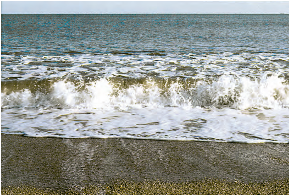
Photograph A for Question 3