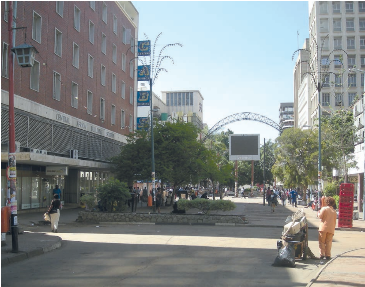
Fig. 2.2 for Question 2