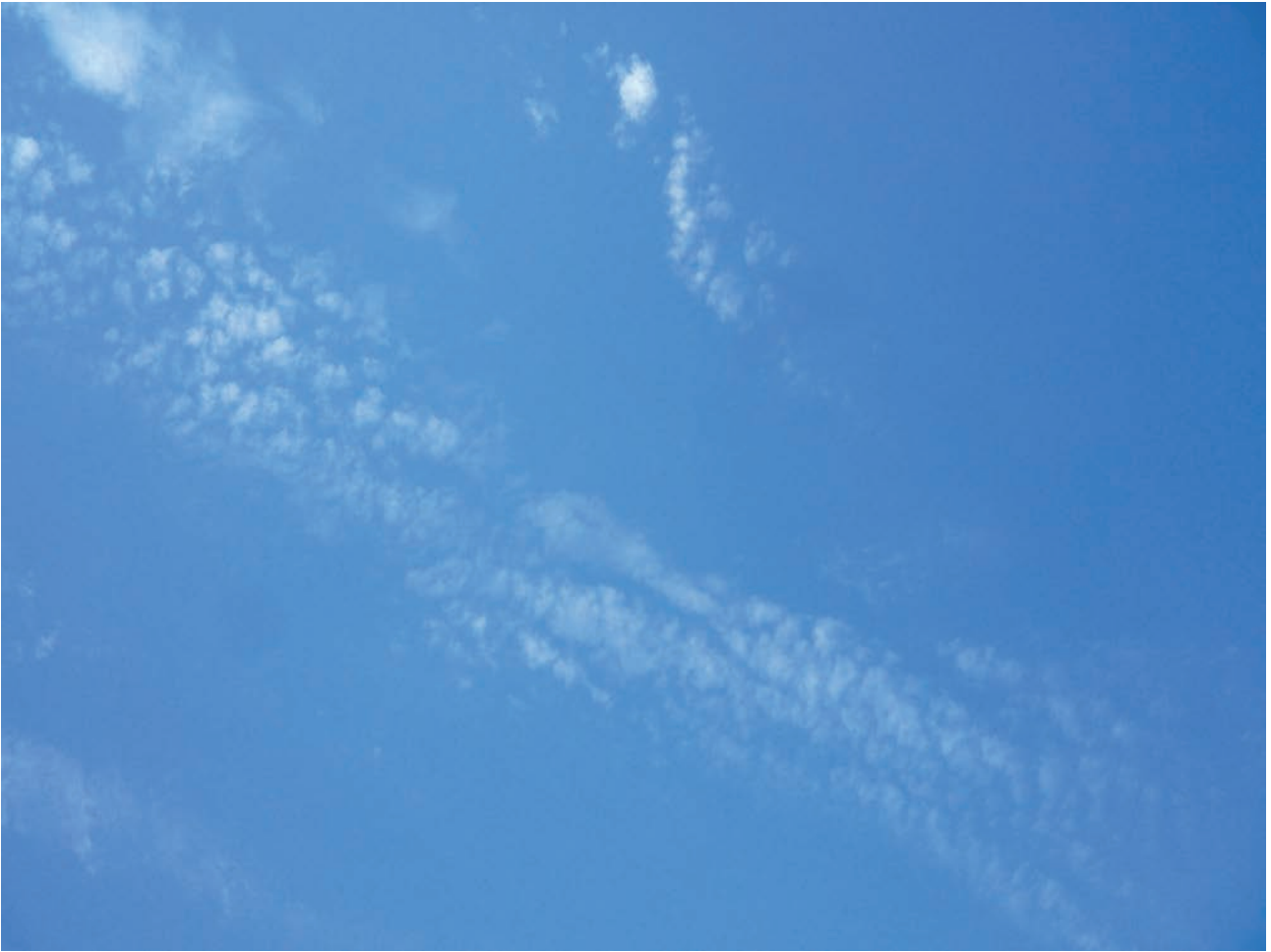
Fig. 4.2 for Question 4