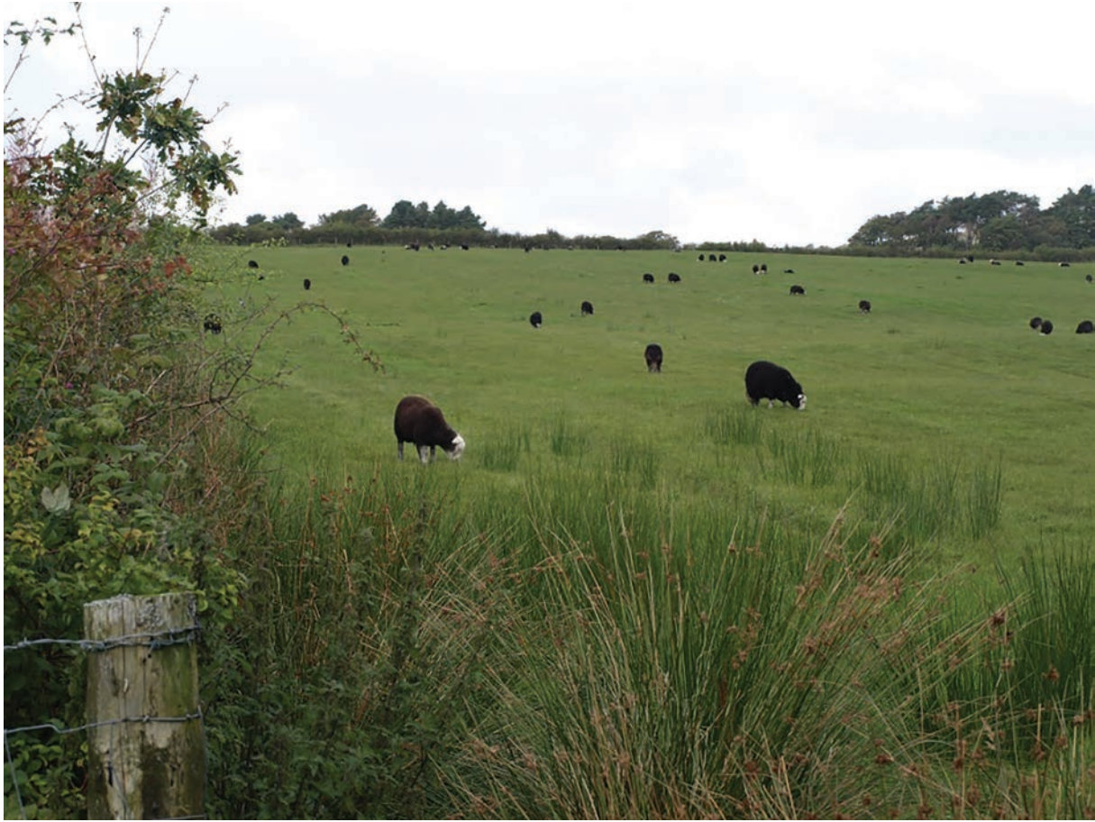
Fig. 5.1 for Question 5