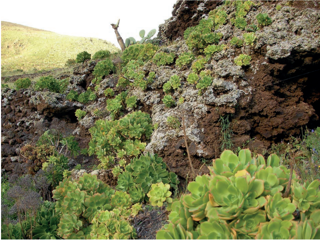
Photograph B for Question 4