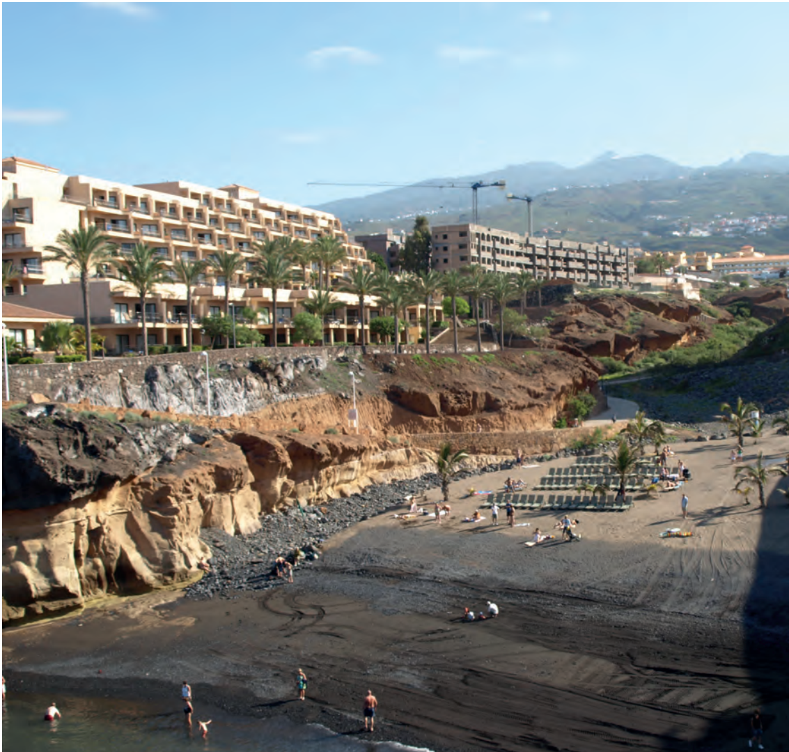
Photograph E for Question 5