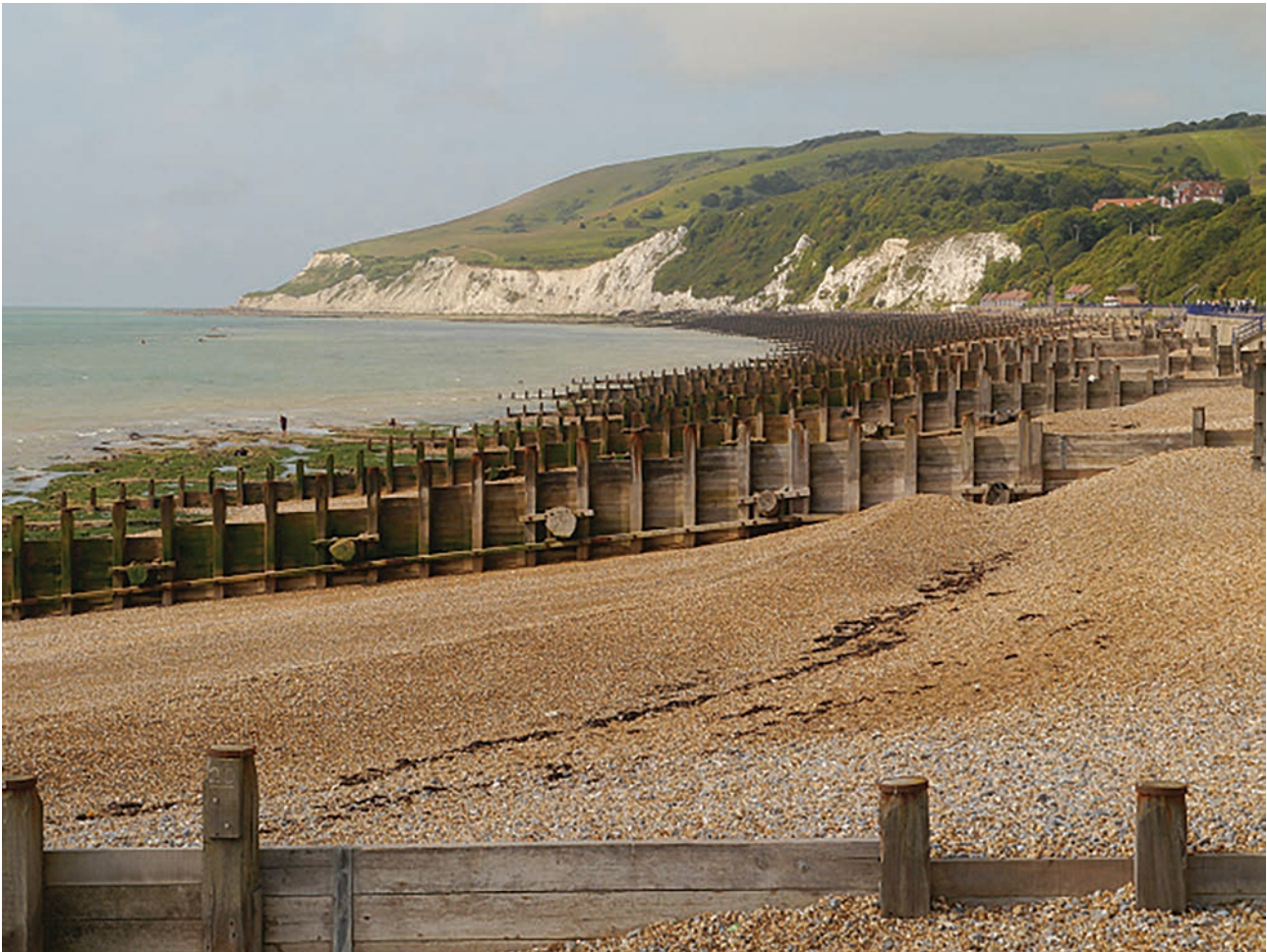
Beach where students did fieldwork