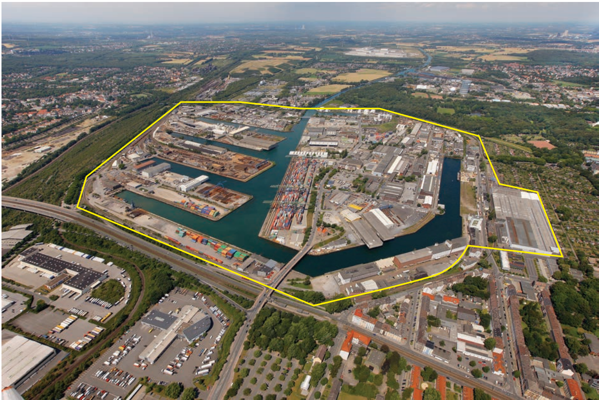
Fig. 3.1 for Question 3