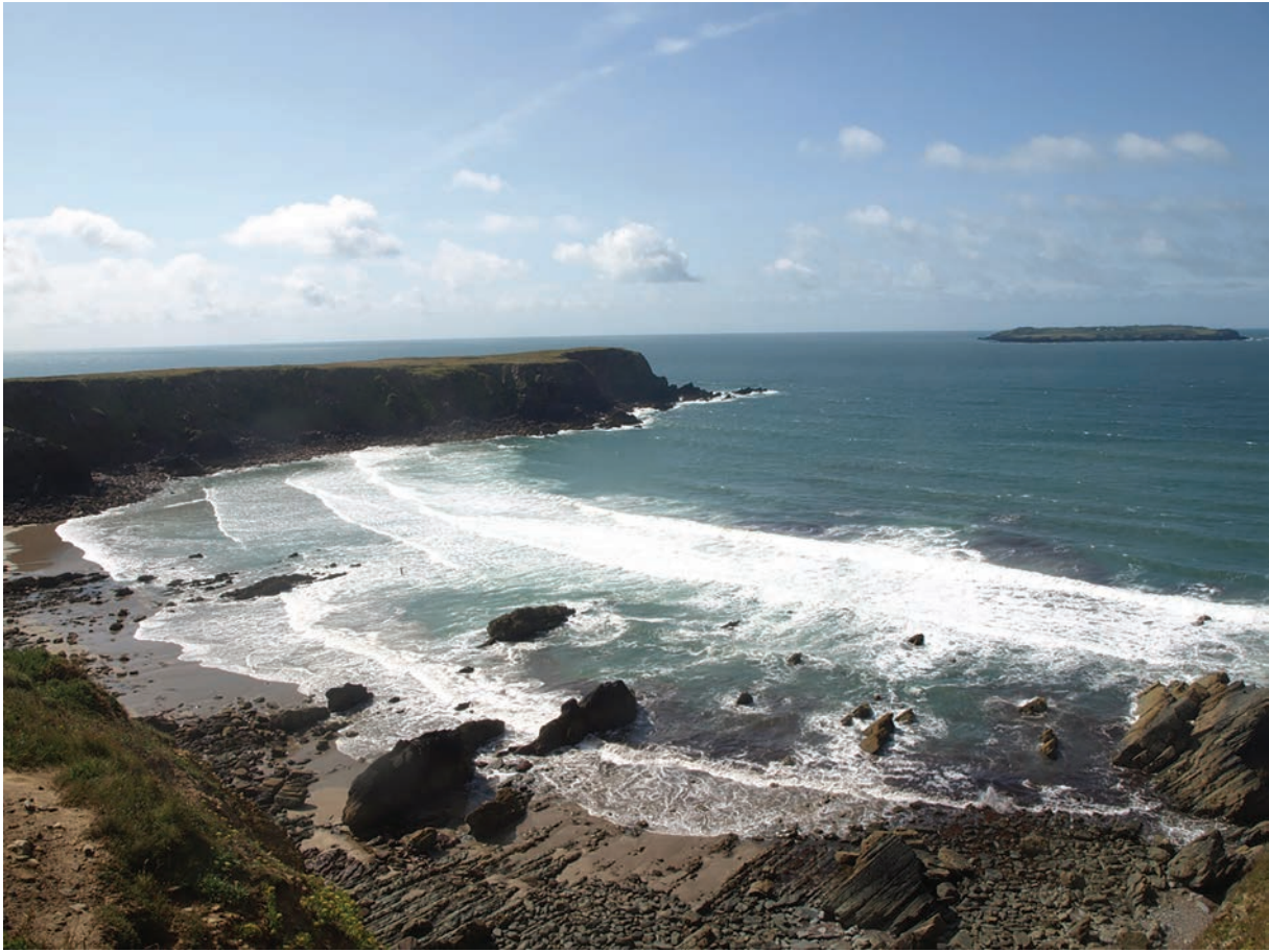
Fig. 4.2 for Question 4