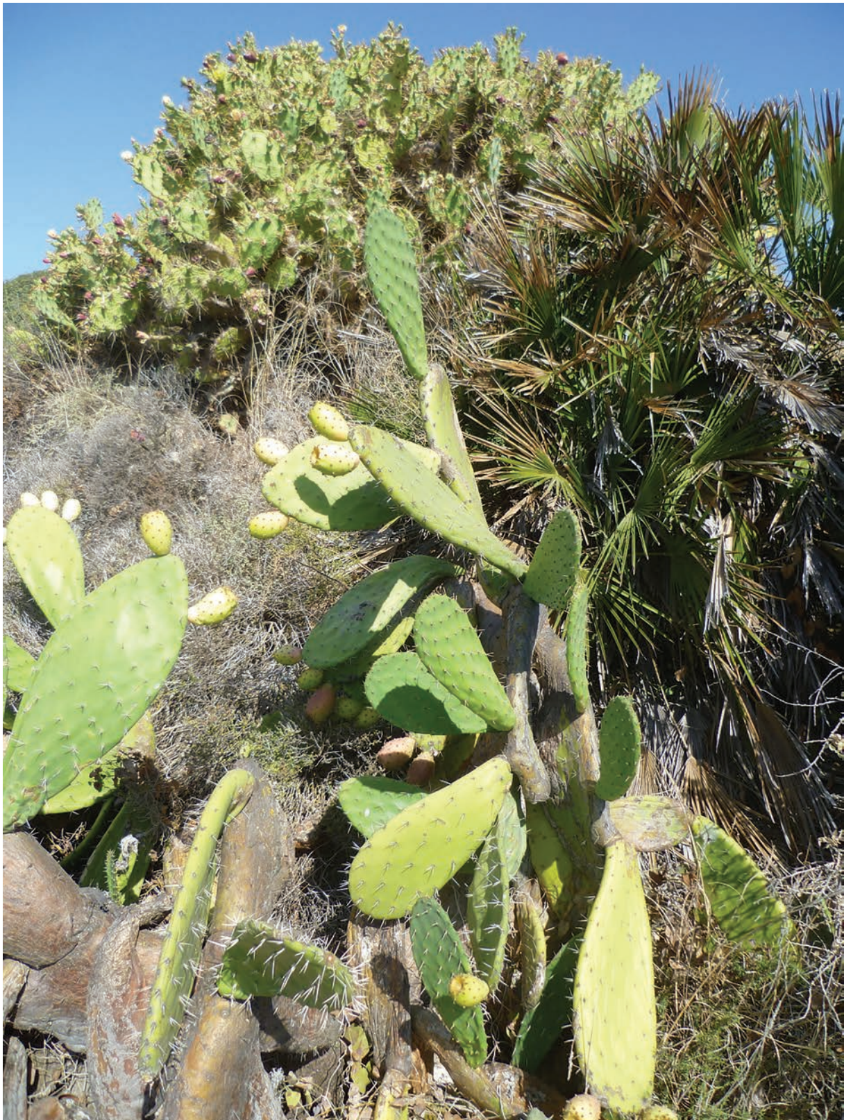
Fig. 3.2 for Question 3