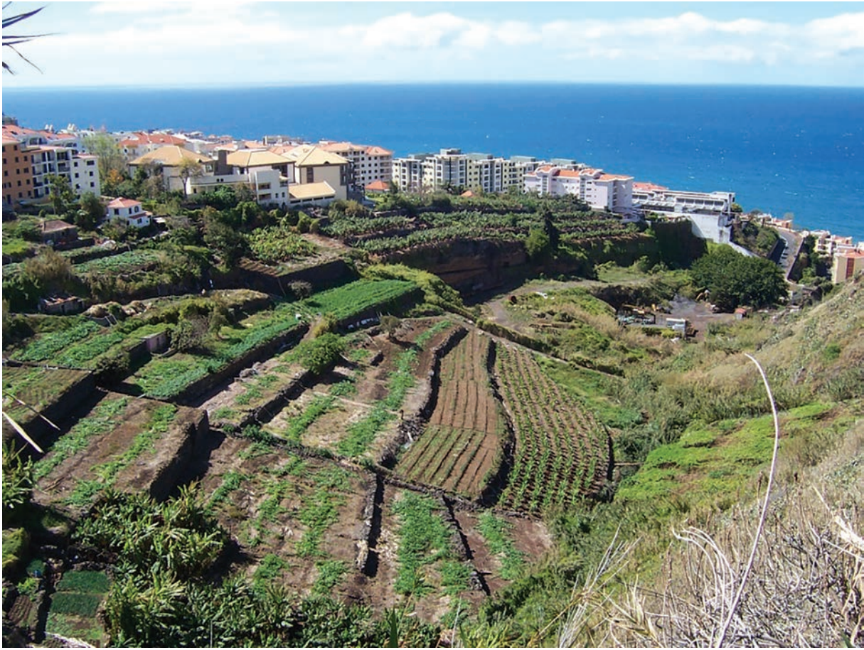
Fig. 5.2 for Question 5