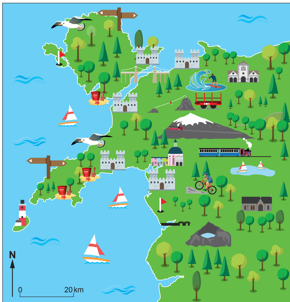
Figure 3: Map showing selected tourist activities in North West Wales

An AS Geography student collected secondary information on some of the most popular tourist activities in North West Wales. The student presented the information on a map, shown in Figure 3 .