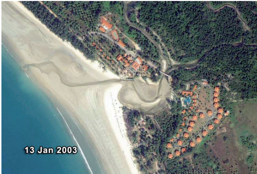
Figure 3: Before and after the tsunami of 26 th December 2004, Khao Lak, Thailand