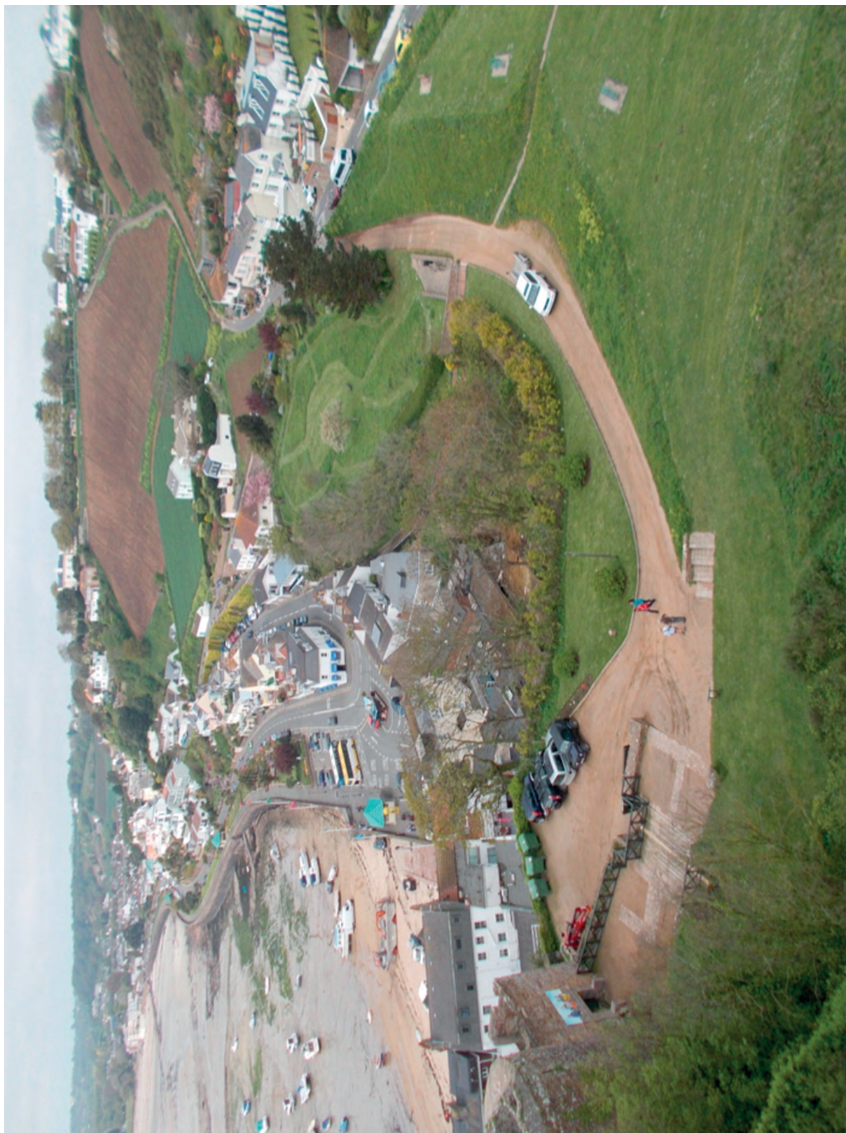
Fig. 2 A photograph of an area in which students plan to carry out a tourism survey.