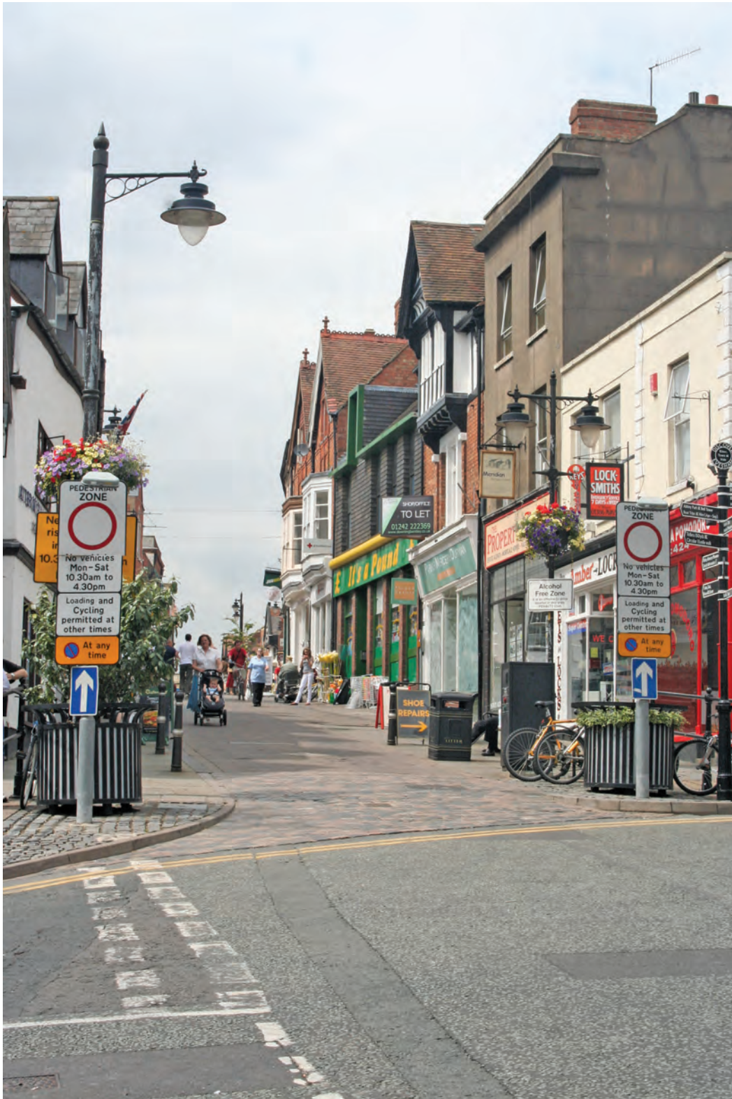
Fig. 3 Photograph of part of the area used for a geographical investigation