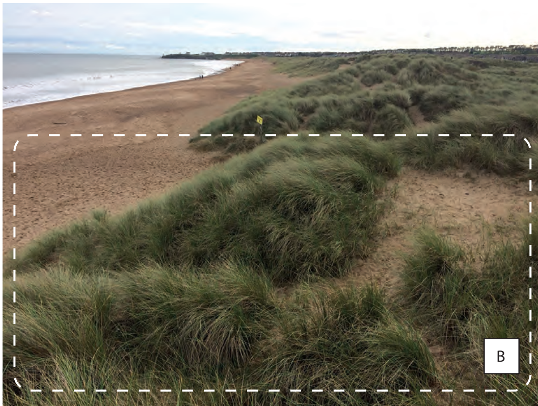
Figure 1 Photographs of two coastal ecosystems