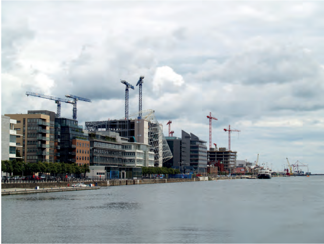
Figure 2 Urban regeneration scheme, Dublin, Ireland